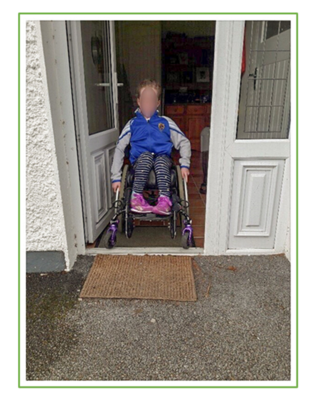
Figure 4. Navigating the slight step at the back door.

Although Sally achieved most of the goals identified at the start of the program, improvements for some skills were not reflected in her post-WST results. Maneuvering sideways was a skill Sally improved, but this was not reflected in her post-WST score. When rolling backwards, Sally looked over one shoulder only. To obtain a higher mark, she would have needed to look over both shoulders. Sally did not have the strength to fold and unfold her wheelchair, resulting in a zero score for that criterion.