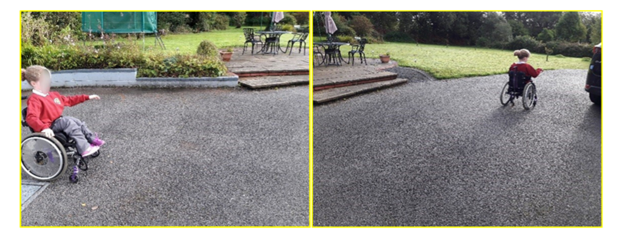
Figure 10. Sally learning to wheel more freely.

Without resources, parents can only support children to the best of their own knowledge. Liz described how Jackie was previously carrying out level transfers,