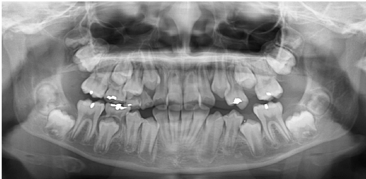
Figure 2. Dental panoramic radiograph of a male subject of Hispanic ethnicity aged 10.20 years.