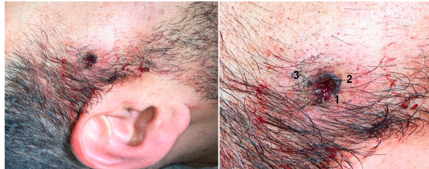
Figure 1. External examination of the victim at the emergency room approximately 4 h after shot revealed an entrance hole of the projectile in the skull in the right temporal bone with excoriation and wound edge (1), burning zone (2), and soot zone with gunpowder residue deposited around the wounds (3).

gunpowder tattooing (i.e., a dirty ring), and a circular black zone of soot typical of shots with a barrel slightly in contact to allow some escape of GSR elements around the hole, but without any tattoo zone.