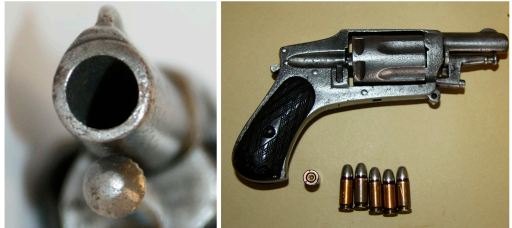
Figure 3. A 6.35 \times 16 SR mm caliber Velo-Dog revolver found at victim's home with clear correspondence with the gun barrel.

Dog revolver was inherited from a relative, and it is now obsolete. Once faced with these findings, the victim ended up confessing that he fabricated the story of aggression, admitting that he suffered from depression that motivated him to attempt suicide at home. Previous clinical records were not available. The patient fully recovered without major sequels.