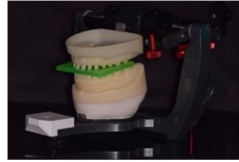
Figure 5. The maxillary working cast is positioned onto the mechanical articulator using digital mounting jig #1 against the previously mounted mandibular diagnostic cast.