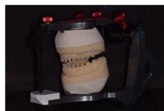
Figure 7. The maxillary and mandibular printed working casts are mounted in CR at the desired VDO on a mechanical articulator.