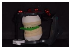
Figure 6. The mandibular working cast is mounted against the maxillary working cast using digital mounting jig #2.