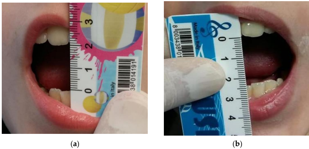
Figure 2. (a) Clinical evaluation after the first appointment. (b) Clinical evaluation after the second session.