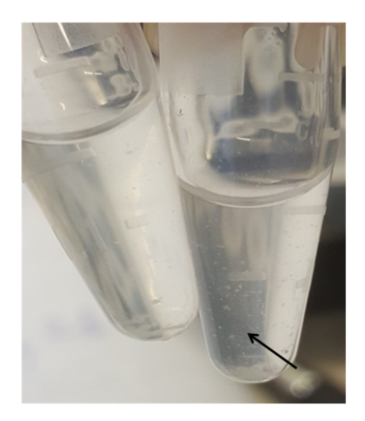
Figure 1. Determination of hyaluronidase activity: on the left—control, on the right—the arrow shows clots, indicating a positive reaction.

Hyaluronidase activity was studied in sterile Eppendorf's; 0.3 mL of hyaluronic acid in a working titer was poured into them, and 0.05 mL of 2 billion suspensions of bacteria were added and put in a thermostat ( 36 \pm 1 °C) for 15 min, and then in the refrigerator for 5 min. Next, 5 drops of 15% acetic acid were instilled into the wells, causing hyaluronic acid to coagulate, and the results were taken into account. The flocculation was taken into account after 5 min [23,24] (Figure 1).