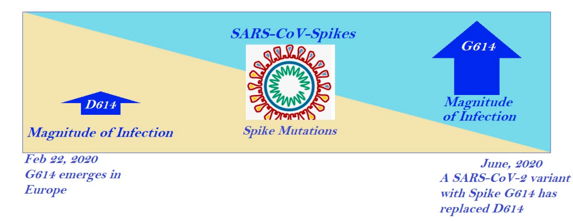
Figure 1. The magnitude of infection of a SARS-CoV-2 variant with spike G614 that has replaced D614 in the US and Europe, which is much greater than the original strain [22,23].

While in the early stages of the COVID-19 outbreak in Wuhan, China, the L type that is more aggressive and has a higher transmission rate than the S type was more prevalent (96.3% L type vs. 3.7% S type), the spread of the aggressive L type dropped after early January 2020. It is hypothesized that human intervention that caused severe selective pressure on the L type is the main reason as to why the milder type of the virus has become common due to selective pressure [18–20]. Now, some evidence shows that the strain circulating in the Western region has possibly evolved during the pandemic [21]. Moreover, in mid-June, a variant of the European type was found in Tokyo that seems to have emerged after three months of mutations. As shown in Figure 1, the rapid rise of D614G in Europe has strongly drawn scientists' attention.