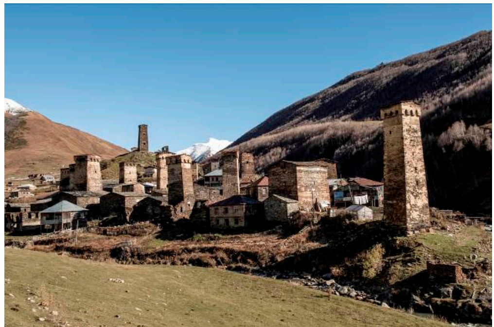
Figure 3. View of Chazhashi, the current World Heritage site in Ushguli, which in the Soviet era was known as the Ushguli–Chazhashi Museum Reserve and has held protected status since 1971 (Applis 2018).

Even in the Soviet era, Svaneti was known for the substantial ethnic homogeneity of its population and distinct conceptions of community and legal precepts, as is typical of some of the mountainous regions of the Caucasus [24–26]. This homogeneity derives from the population’s subsistence from agriculture at an altitude of 1500–2500 m and the resulting need for a collective lifeworld and long-term maintenance of strong identification with a shared origin and heritage. A concomitant issue is that the population has a clearly defined idea of their own identity and a distinct delimitation from neighboring groups [27].