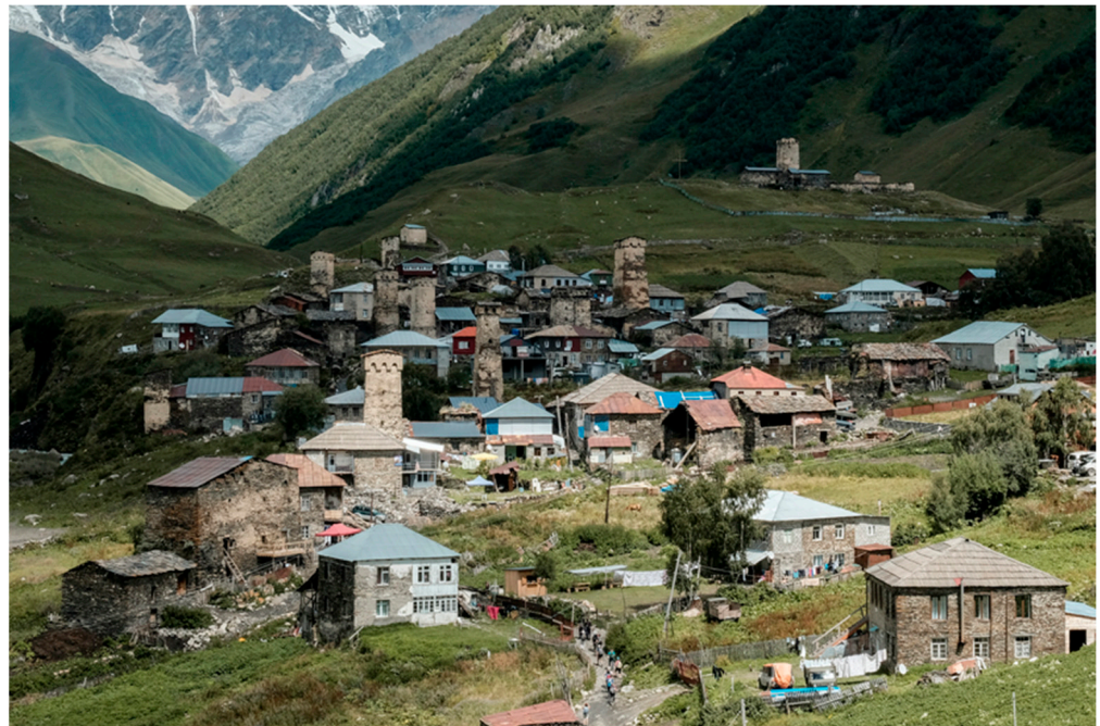
Figure 2. The upper villages of Ushguli with Mount Shkhara in the background (Applis 2019).