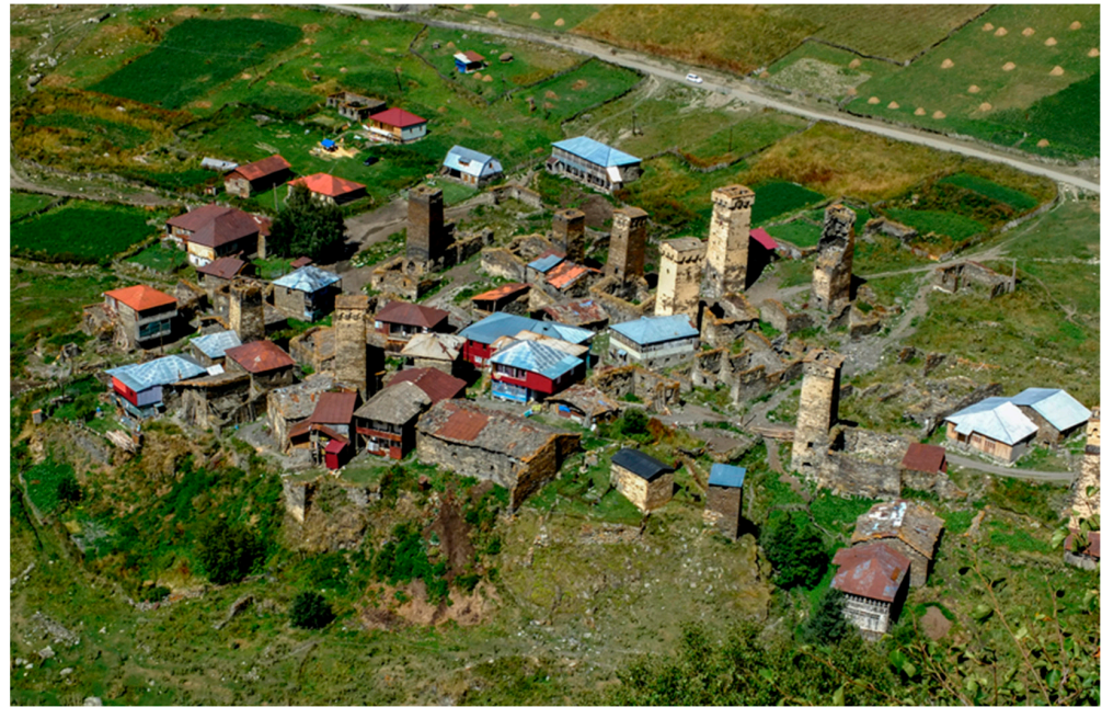
Figure 7. The tin roofing of Murkmeli does not meet the monument requirements; however, the villagers depend on the inexpensive type of roofing (Applis 2015).

local communities. Digital platforms play a special role here. On the one hand, they enable locals to become tourism actors; on the other hand, they generate practices that endanger their tourism engagement. In regions previously affected by emigration, competition can be intensified by the return of former emigrants, as is the case in Ushguli.