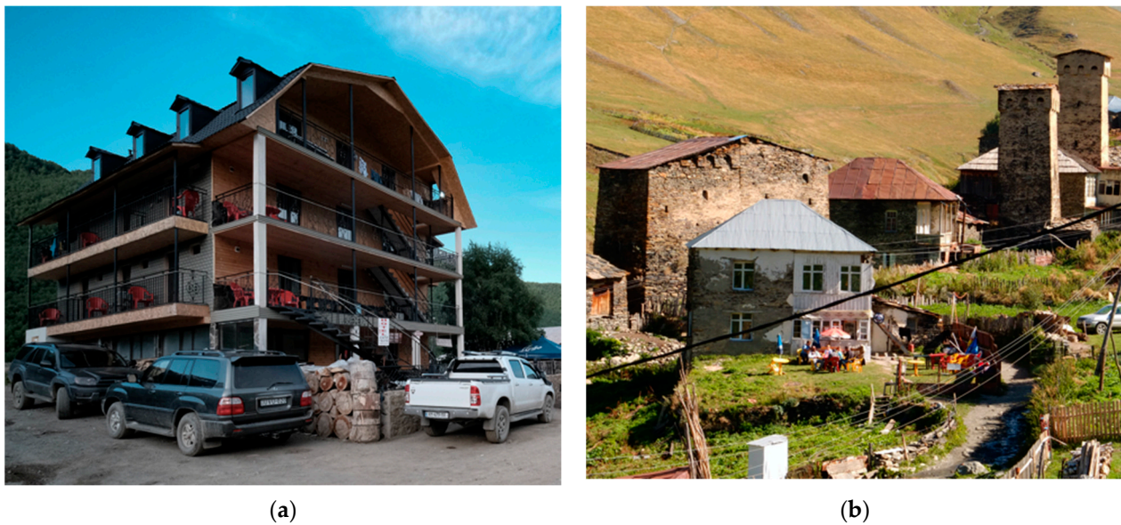
Figure 4. Different ways of constructing tourist space: (a) newly built hotel in European Alpine style (Applis 2019); (b) simple garden café in front of a 1950s Soviet-era building (Applis 2015).

From the early Soviet-era onwards, the region found itself the target of specific cultural interventions, typical for Soviet policy around nationality and national identities [28] (pp. 90ff.) about the relationship between the state and traditional law in Soviet times. However, Svaneti remained an exemplary region for limitations of measures that were intended to bring about cultural transformation. The Soviet authorities finally failed in their endeavors to break up local notions and institutions of law, such as councils of elders. Even in Soviet times, these councils intermediated in the arrangement of marriage, issues relating to the distribution of land and attempts to quell vendettas [24]. Even current studies suggest a continued high acceptance of such practices. They also indicate that non-Svan ethnic Georgians regard the country's mountain people as possessing an authentic core of ethnonational "Georgianness", inextricably linked to Georgian Orthodox Christianity [29].