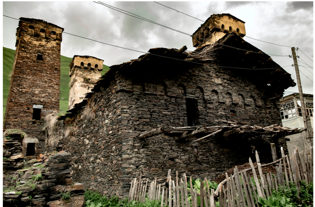
Figure 6. Dilapidated medieval building in Murkmeli, the bottom village of the village community of Ushguli; the owners of the historic building have no means to preserve it. As Murkmeli is not a World Heritage Site, the various Georgian governments have not invested in the preservation of its buildings (Applis 2019).

The scarcity of money, should the majority of visitors from abroad continue to stay for only one day, is also shown by the fact that residents blocked the road from Mestia to Ushguli for several hours in August 2019 in protest because of the collapse of another tower. The families cannot maintain their cultural heritage from their resources (see Figure 6). Except for the early years of the Saakashvili government, the state has so far not provided any financial support for this, as it also lacks income. Finally, UNESCO does not offer financial support for the preservation of cultural heritage, even though the requirements for restoration following the preservation order are high.