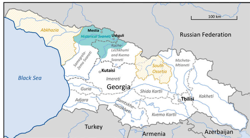
Figure 1. Placement of the historical region of Svaneti in the recent political map of Georgia according to regions with the zones of the Abkhazian and South Ossetian conflict (Applis 2022).

and disseminate a country's tourism potential internationally. Secondly, they, for example, enable small businesses to advertise their offers for overnight stays online without much effort. On the other hand, the internal algorithms of the platforms ensure permanently low prices, which in turn increases the economic pressure on advertisers. In the following, the consequences of this change are outlined. In a region like Svaneti, which is characterized by traditional values and where values such as "hospitality" [13,14] are normal, those changes have serious social consequences, in addition to the economic ones, which can lead to a destabilization of village communities.