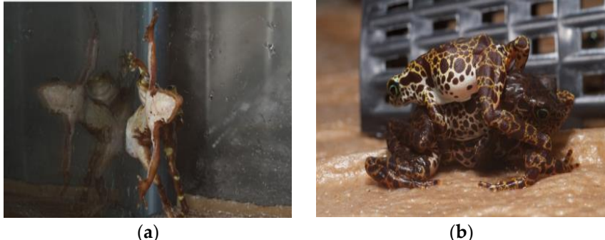
Figure 2. Cont.

The information generated so far is limited to the Anura order; however, future research could evaluate whether there is a correlation between the presentation of certain behaviors and the well-being of individuals.