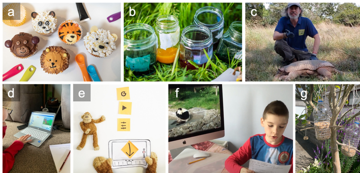
Figure S1. Example Discoveries from VSS (a) Zoo Cupcakes, (b) Nature Art, (c) Conservation Expert, (d) Coding Mission, (e) Stop Motion, (f) Commentary Challenge and (g) Wildlife Live.