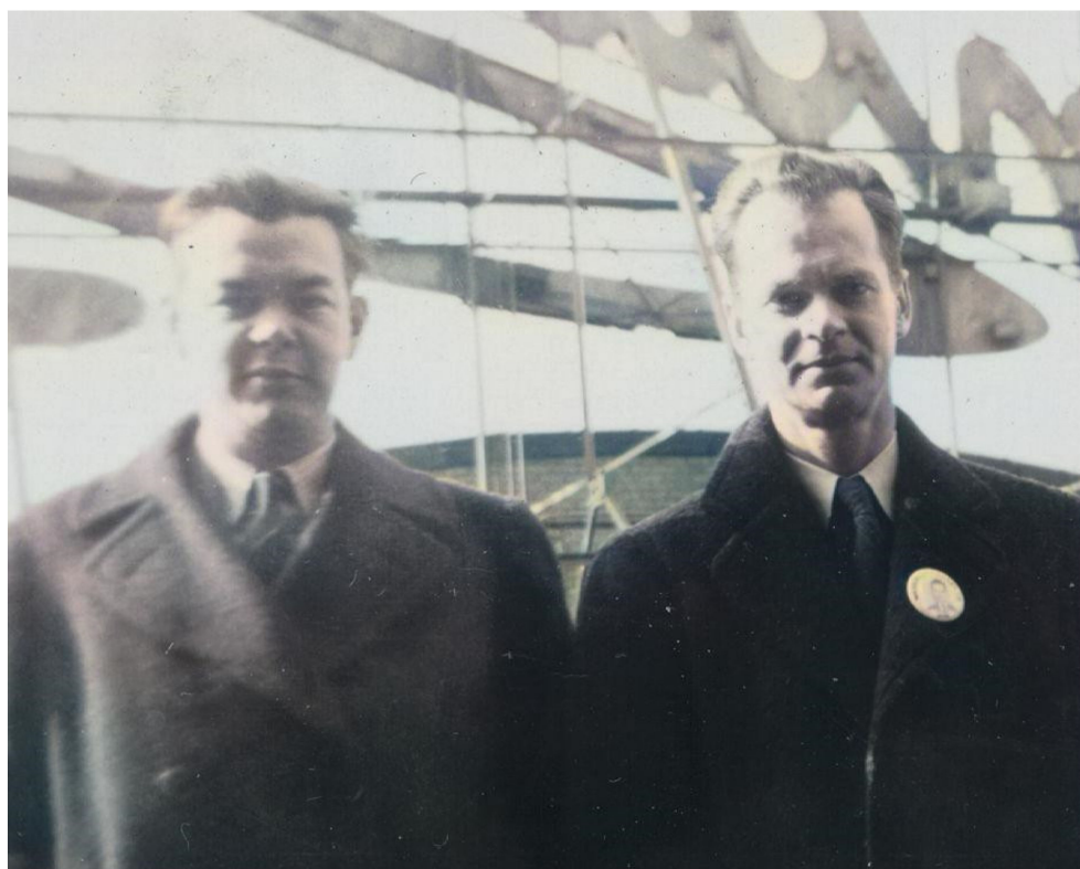
Figure 1. Colorized photo of Keller Breland (left) and B. F. Skinner on top of the General Mills building in Minneapolis, MN, USA, circa 1943. (Photo courtesy of Robert E. Bailey).