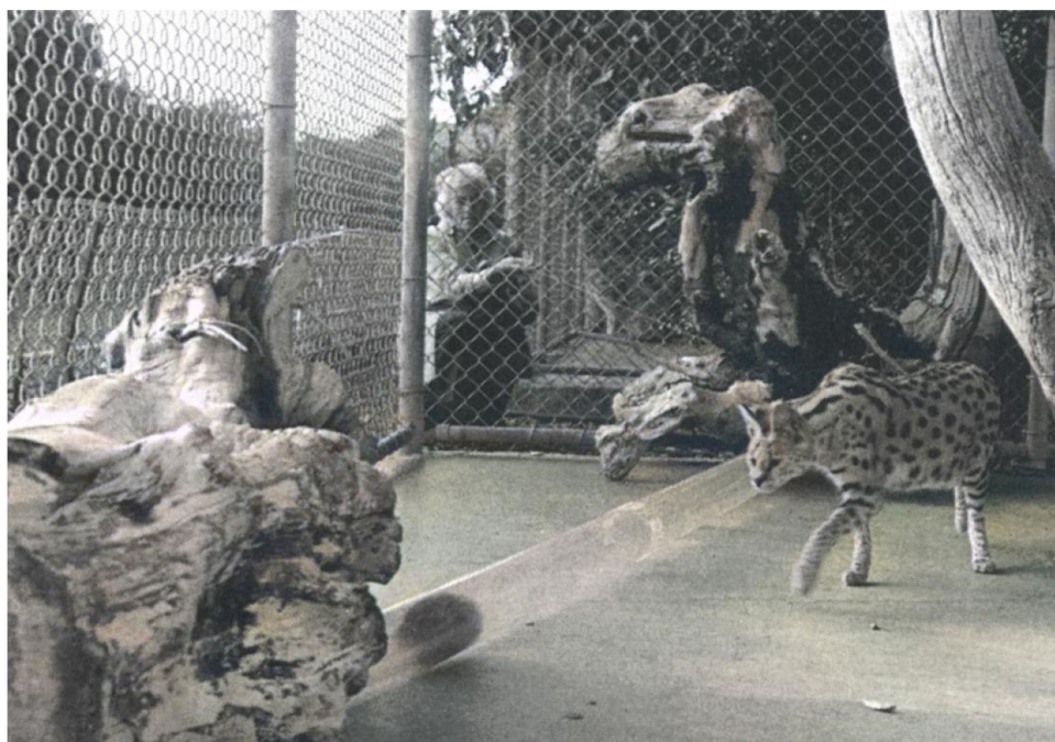
Figure 6. Colorized photo of a serval chasing artificial prey at the San Francisco Zoo, circa 1984. (Reproduced from [74] with permission of Elsevier, 1982).

The result has been the introduction of environmental enrichment as an approach that is both pragmatically focused and attends to the species-typical needs of the organisms involved. The use of enrichment is one of those rare events that requires simultaneous attention to both evolutionary and learning histories to be optimally implemented, which necessarily requires an integration between naturalistic and engineered exhibits [14,76]. Equally important for the zoo is how the visitor behaves in response to enriched animals, therefore driving the need for naturalistic devices and responses for and from the animals being enriched, respectively [77,78]. Environmental enrichment, because of its behavior analytic underpinnings, is now an animal welfare endeavor where all features of how an animal interacts with its environment are examined for their behavioral benefits [5,79].