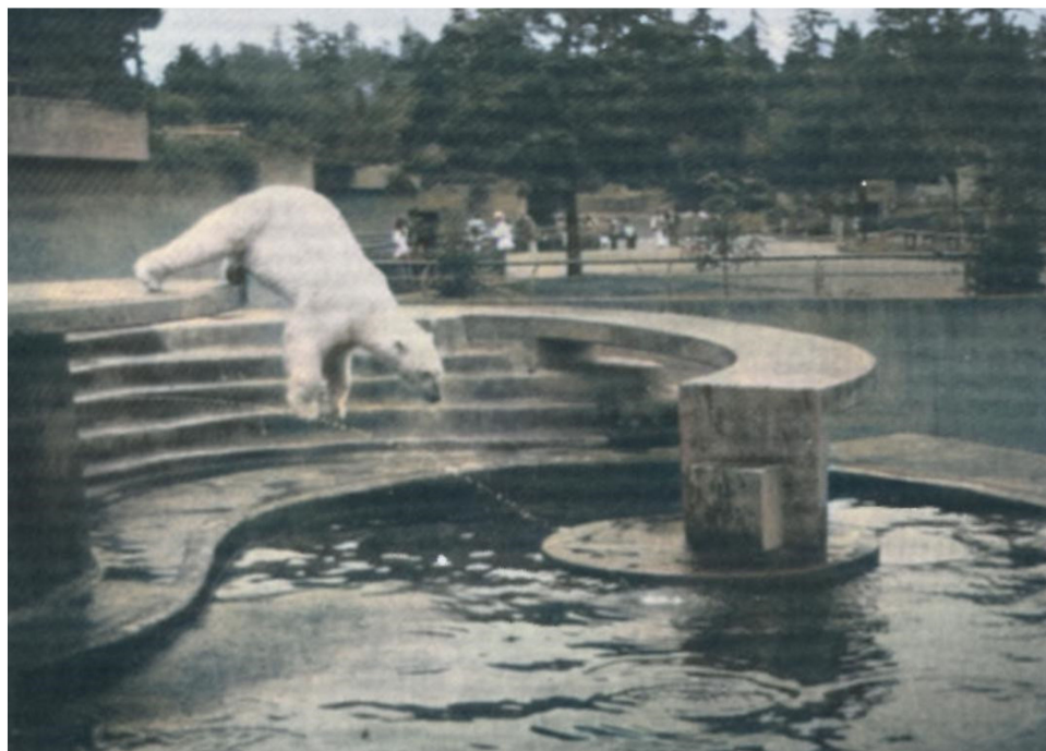
Figure 4. Colorized photo of a polar bear chasing a frozen fish catapulted into their pool at the Portland (Oregon) Zoo, circa mid-1970s.

Among the criticisms of such applications were the artificiality of the procedures involved, as well as the arbitrary distinction of what constituted ‘desired’ responses to be increased [65–67]. These critics argued that, rather than engineering environments through contrived contingencies, zoos should focus on creating naturalistic exhibits that increased