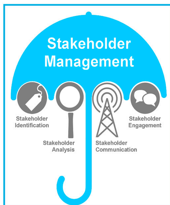
Figure 1. Schematic of the methodology applied for stakeholder management [10].

The applied methodology and its main outputs are utilized as valuable input in development of different protocols and models that contribute in improved cross-border/regional water supply [11]; e.g., drinking water protection zones in the Adriatic region, state-of-the-art and guidelines for the improvement of the present status [12], common protocols for water resources monitoring activities in the Adriatic region [13], guidelines for long-term cross-border water supply planning [6], long-term cross-border water supply planning, and regional drinking water supply economics models [14], etc.