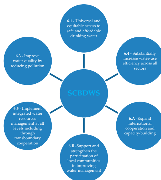
Figure 2. Interlinkage between sustainable cross-border drinking water supply (SCBDWS) and Sustainable Development Goal 6 (SDG6) targets (modified after [1]).