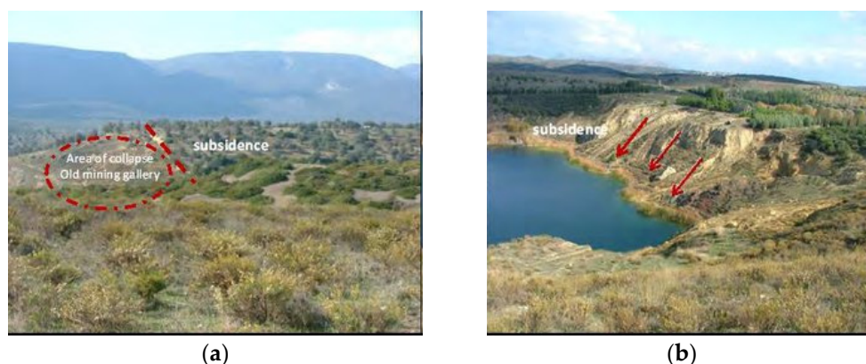
Figure 5. Aliveri pit lake: (a) SW lake's slope, where failures were observed and (b) west area where subsidence is depicted [11].

In the Aliveri area, two pit lakes were created in the final voids (Figure 5). The total water volume of the big lake was estimated at approximately 450,000–500,000 m 3 and its depth at approximately 50 m [10,11]. The lake was created after the completion of the surface lignite exploitation. The creation of remnant lakes seems to be an aesthetically acceptable solution. However, subsidence appeared at the north slope, making this area not accessible and the pit lake not stable and functional (Figure 4) [11]. The lake's water level tends to increase with time, as the main recharge comes from the rainfall, which is high in this area (900 mm/year).