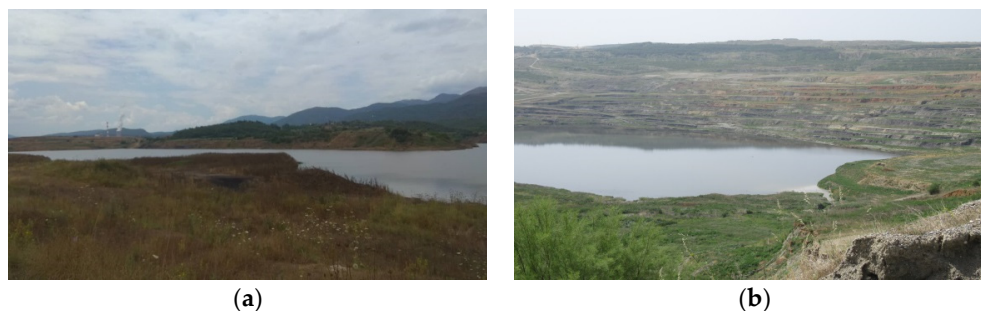
Figure 4. (a) Kyparissia pit lake and (b) Amynteon pit lake.

other aquifer systems. The maximum depth of the lake water is approximately 15 m, with a surface of 0.25 km 2 and with limited potential development.