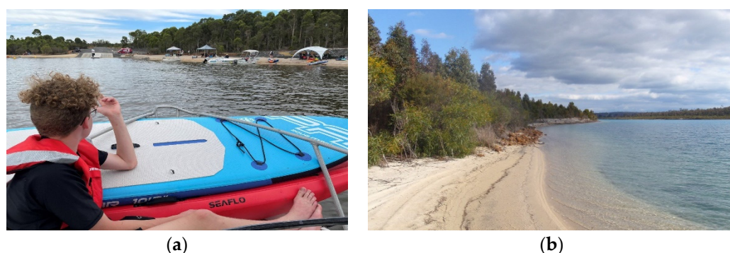
Figure 3. (a) Lake Kepwari in 2009; (b) locals and tourists recreating at Lake Kepwari soon after it opened in summer 2021 [3].

The town of Collie is strongly related to the mining industry and power generation, though tourism is becoming an essential driver of a more diversified economy. The transformation of Lake Kepwari into a recreation hub for water sports is expected to attract an influx of tourists (Figure 3). Early estimates anticipate that after three years, Lake Kepwari should attract up to 22,000 overnight stays and 37,000 day trip visitors annually [3].