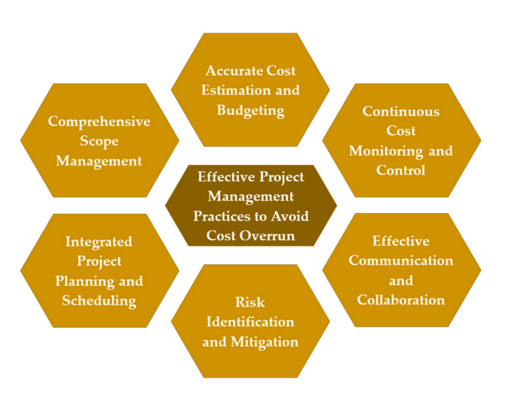
Figure 2. Effective project management practices to avoid cost overrun in construction projects.

Table 2. Effects of project management practices on cost overrun in construction projects.