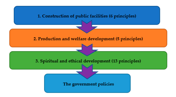
Figure 1. The 13 principles of the government policies.

Therefore, Figure 1 illustrates the 13 principles of Article 12 of the Regulations on Community Development Work as: