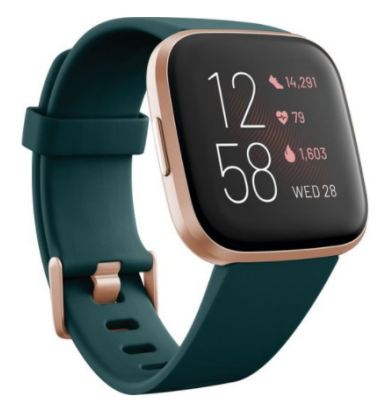
Figure 1. Image of Fitbit Versa 2 device [16].

As mentioned, the data comprised 60 days' worth of data from a type 1 diabetic individual acquired across the summer period. The glucose level distribution spanned 4-10 mmol/L, classification exercise involved the prediction of glucose level into two discrete bands comprising 'Excellent', with an associated glucose level measure in the range of 4–7 mmol/L; and 'Good', with an associated glucose level measure in the range of 7–10 mmol/L. It should be noted that further classes could not be created due to the effective management of glucose level within a tight band by the diabetic individual. The glucose readings were monitored by the Fitbit device, where 120 samples of the glucose levels were recorded daily, therein providing a glucose sample rate of 120/day. These 120 glucose readings were averaged out to produce a corresponding glucose level reading per day, which in turn contributes towards uncertainty reduction through lessening the effect of device drift from the readings provided by the device, as per ergodic theory. The inputs used to form a feature vector in this study correspond to solely physical activity features as reported by the Fitbit and can be seen in Table 1. These features are specific activity attributes which reflect an individual's overall activity level, which can be said to influence a person's glucose levels.