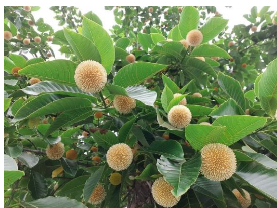
Figure 30. Neolamarckia cadamba .