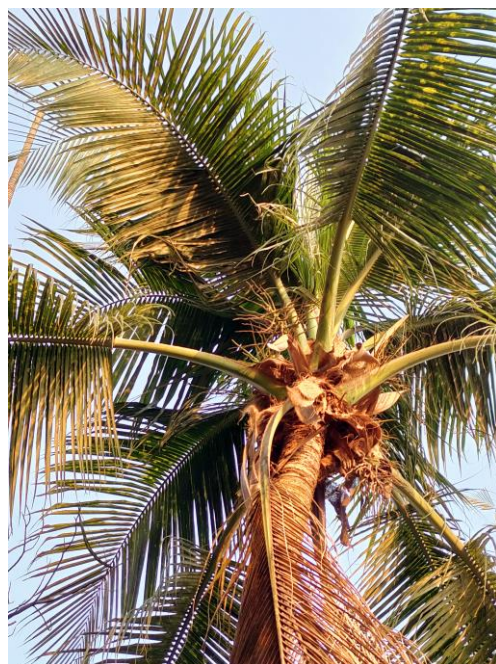
Figure 18. Cocos nucifera .