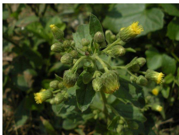
Figure 10. Blumera lacera .