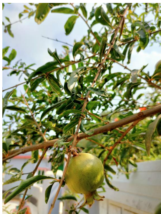
Figure 32. Punica granatum .