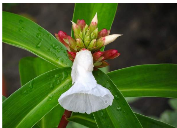
Figure 19. Costus speciosus .

ethanolic root extracts from C. speciosus lowered the concentration of blood glucose, decreased glyconeogenesis and increased glycogenesis, reinstating normal levels of glucose in the blood when administered to alloxan-induced diabetic rats [50]. An oligosaccharide called raffinose, which was isolated from the C. speciosus rhizome, increases glucose uptake in a dose-dependent manner. Through an increase in Glut4 translocation via IR \beta /PI3K/Akt phosphorylation, its ability to increase insulin sensitivity was observed. Raffinose's capacity to inhibit the activation of GSK3 for glycogen synthesis provides additional proof that it has therapeutic potential for treating diabetes [153]. In a study conducted by Mar (2019), 70% ethanolic extracts of C. speciosus rhizome were administered to albino mice, according to the OECD 423 guidelines. No mortality or toxicity were observed in the animal models, even with a maximum dose of 5000 mg/kg body weight over an observation period of 14 days, indicating the safe usage of the C. speciosus [57].