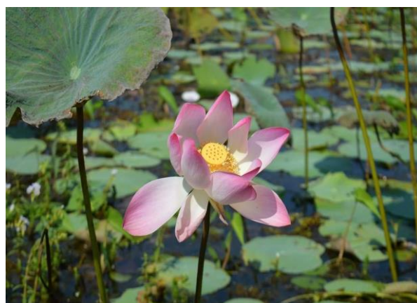
Figure 29. Nelumbo nucifera .

Wistar rats, which were observed for a subsequent 24 h and then 14 days for signs of toxicity or morbidity. The extract was also administered in 250-mg/kg-body-weight doses to STZ-induced male Wistar rats with 0.25 mg/kg body weight glibenclamide as a reference drug to investigate its possible hypolipidemic and hypoglycemic activities. The extract significantly ( p < 0.05 ) lowered fasting blood glucose, total cholesterol, triglycerides and low-density lipoprotein. The acute-toxicity test revealed that the extract did not confer any toxicity or mortality, even at 2000 mg/kg body weight [63]. Nelumbo nucifera leaf extract was evaluated for its antidiabetic efficacy by Sharma BR et al. (2016). The results suggested that leaf extracts reduce the toxicity of pancreatic \beta -cells in type 1 diabetes, followed by the increased secretion of insulin from pancreatic \beta -cells [177]. This mechanism of action clearly indicates its antidiabetic potential.