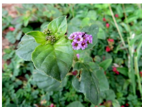
Figure 11. Boerhaavia diffusa .

Boerhaavia diffusa (Figure 11), also known as hogweed, is a species of flowering plant in the Nyctaginaceae family. Various parts of the plant, particularly the roots, have been associated with anti-diabetic, anti-cancer, gastroprotective and hepatoprotective properties. The plant contains steroids such as ecdysteroids, alkaloids, lignan glycosides, phenolic glycosides, flavonoids, isoflavonoids such as rotenoids, etc. [96]. According to a study conducted by Nalamolu (2003) et al., the chloroform extract of B. diffusa leaves reduced the blood glucose in STZ-induced diabetic rats in a dose-dependent manner when used in daily doses of 50 mg/kg, 100 mg/kg and 200 mg/kg body weight compared to the standard drug, glibenclamide. The blood glucose was probably reduced by the rejuvenation of pancreatic \beta -cells [54]. The ethanol extract of Boerhaavia diffusa exhibits therapeutic potential against type 2 diabetes by inhibiting small intestinal glucose absorption and stimulating muscle glucose uptake [97]. In an acute-toxicity study by Hiruma-Lima (2000), extracts obtained from lyophilized decoction and the juice of fresh leaves of B. diffusa were administered in doses of up to 5000 mg/kg body weight in mice after 12 h fasting. The animals were subsequently observed for 14 days. No signs of toxicity or mortality were observed until the dose of 5000 mg/kg body weight [98].