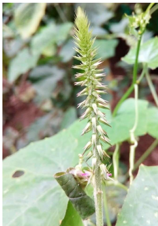
Figure 1. Achyranthes aspera .