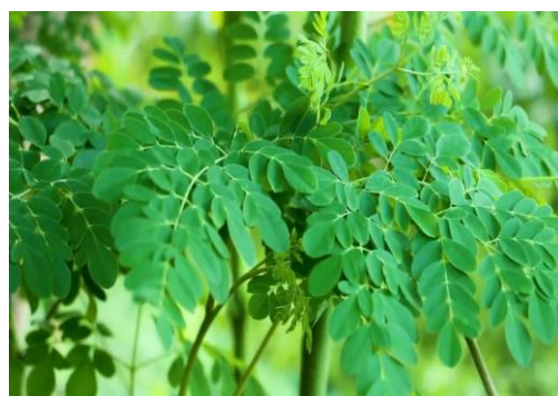
Figure 27. Moringa oleifera .