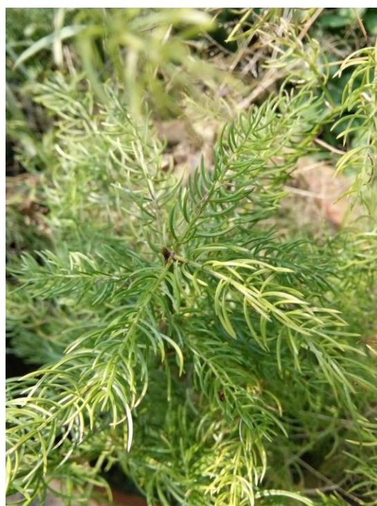
Figure 8. Asparagus racemosus .