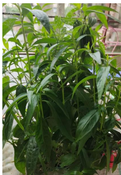
Figure 5. Andrographis paniculata .

Commonly known as green chiretta, Andrographis paniculata (Figure 5) is a plant in the Acanthaceae family, native to Southern Asia. The plant has been reported to have anti-inflammatory, antioxidant, anti-diabetic and anti-infective properties. It is deemed a natural antibiotic, containing compounds such as terpenoids, flavonoids, iridoids, ferulic acid and, in particular, diterpenoid lactones, such as andrographolide, 14-deoxyandrographolide and 14-Deoxy-11,12-dehydroandrographolide, which are ferulic acids [27]. Andrographolide has been reported to have anti-diabetic properties. In a study conducted by Akter et al. (2013), the administration of 1000 mg/kg of ethanolic extract of A. paniculata leaves in Alloxan-induced diabetic Wistar rats significantly reduced their elevated blood glucose ( p < 0.01 ). To test the acute toxicity of the extract, it was administered to rats orally and intraperitoneally at 4000 mg/kg body weight; the animals were observed for the next 24 h and then for 10 days for signs of mortality. The extract conferred no toxicity [28]. A study by Augustine et al. (2014) suggested that A. paniculata lowers blood glucose levels by regulating glucose uptake and oxidation, restoring insulin-signaling molecules in the liver and reducing serum lipid levels [29].