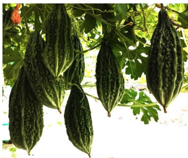
Figure 26. Momordica korola .