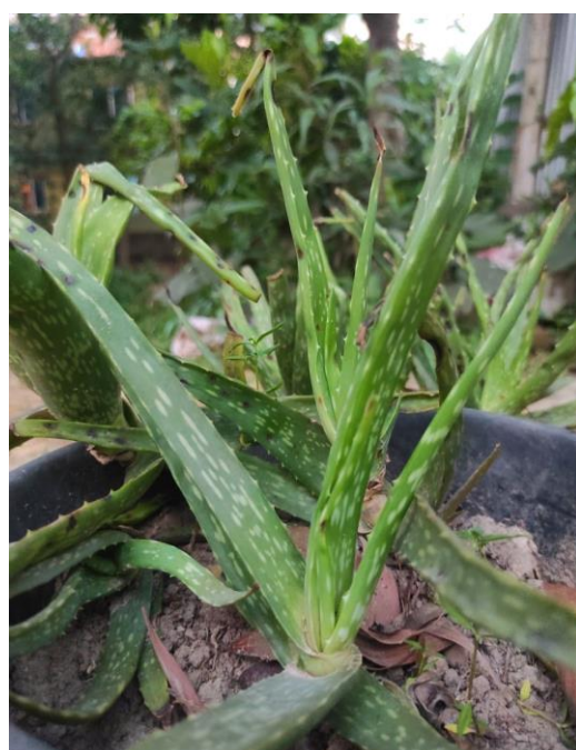
Figure 2. Aloe barbadensis .