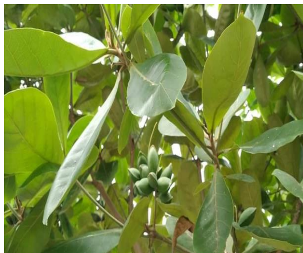
Figure 35. Terminalia catappa .

According to a study by Ahmed et al. (2005), aqueous and cold plant-leaf extracts reduced fasting blood sugar levels in alloxan-induced diabetes rats, with glibenclamide (10 mg/kg body weight) used as a control. The regeneration of the pancreas was confirmed by the results of histological tests [59]. The anti-diabetic properties of Terminalia catappa leaf extract involve the activation of the PI3K/AKT pathway, the reversal of insulin resistance and the enhancement of glucose transport in type 2 diabetes [188]. Azrul et al. (2013) conducted a toxicity study in which they investigated the primary and secondary toxicity of a crude aqueous extract from T. catappa in Sprague–Dawley rats by administering 0.5, 1.0 and 3.0 g/kg body weight of the extract to the rats for 14 days. No mortality or signs of toxicity were noted in the rats [169].