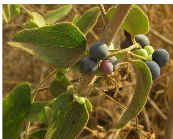
Figure 17. Cocculus hirsutus .

Locally known as Daikhai or Jalajmani and commonly known as Broom creeper, Cocculus hirsutus (Figure 17) belongs to the family Menispermaceae. Its root and leaf extracts have been reported to show laxative and antiperiodic properties and alleviate symptoms of eczema and gonorrhea. The plant contains alkaloids, \beta -sitosterol, ginnol, flavonoids such as luteolin, kaempferol, quercetin, glycosides, carbohydrates, tannins, saponins and steroids, among others and possesses anti-diabetic, antibacterial, anti-cancer and antifungal activities [125]. A study conducted by Badole et al. (2006) demonstrated that the administration of 250 mg/kg, 500 mg/kg and 1000 mg/kg body weight of aqueous extract from C. hirsutus leaves in alloxan-induced diabetic mice for 28 days significantly reduced serum glucose levels ( p < 0.01 ), with 10 mg/kg body weight p.o. of glyburide used as the standard drug [56]. The exact mechanism of the glucose-lowering effect of this plant extract is yet to be established. Bothara, Marya and Saluja (2011) performed an acute toxicity test for C. hirsutus methanolic and aqueous extracts in male Wistar albino rats, in which the LD50 of the extract was found to be 3000 mg/kg body weight [147].