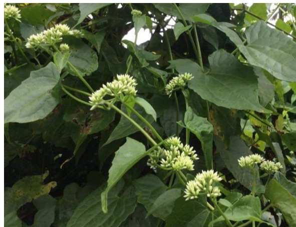
Figure 25. Mikania cordata .

out by following OECD-423 guidelines and administering the extract at doses of 5, 50, 300 and 2000 mg/kg body weight. The female mice were observed for the next 24 h and then for 14 days for signs of toxicity or mortality. The extract did not confer toxicity or mortality, even at doses up to 2000 mg/kg body weight [64].