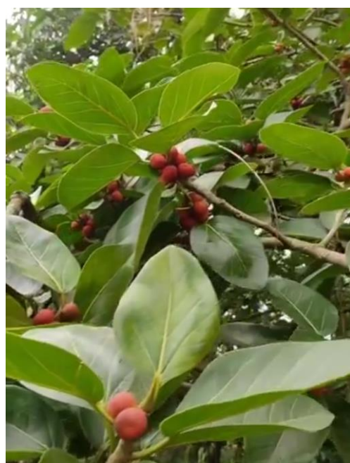
Figure 20. Ficus benghalensis .

A study conducted by Saraswathi et al. (2013) demonstrated that the administration of 200 mg/kg and 400 mg/kg body weight of ethanolic extract from F. benghalensis leaves in alloxan-induced diabetic albino rats reduced blood glucose, cholesterol and triglyceride levels [52]. In another study, by Kasireddy et al. (2021), it was reported that an ethanolic extract of F. benghalensis lowered blood glucose in STZ-induced diabetic rats by stimulating insulin secretion from the Islets of Langerhans p < 0.01 [53]. The bark of F. benghalensis shows an anti-diabetic effect through a mechanism that includes the inhibition of the carbohydrate-hydrolyzing enzymes, \alpha -amylase and \alpha -glucosidase [154]. A network-pharmacology study suggested that F. benghalensis bark extract increases glucose uptake and insulin secretion through the PI3K/Akt signaling pathway, supporting other wet-laboratory research [155]. Gabhe, Tatke and Khan (2006) investigated the acute toxicity of the methanolic extract of F. benghalensis by orally administering a single dose of 2000 mg/kg body weight of the extract to rats and observing them for signs of toxicity for the next 14 days. The study's results demonstrated that the LD50 of the methanolic extract of F. benghalensis was more than 2000 mg/kg body weight [123].