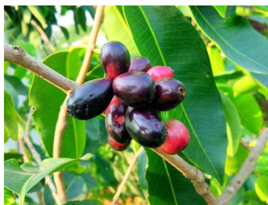
Figure 33. Syzygium cumini .