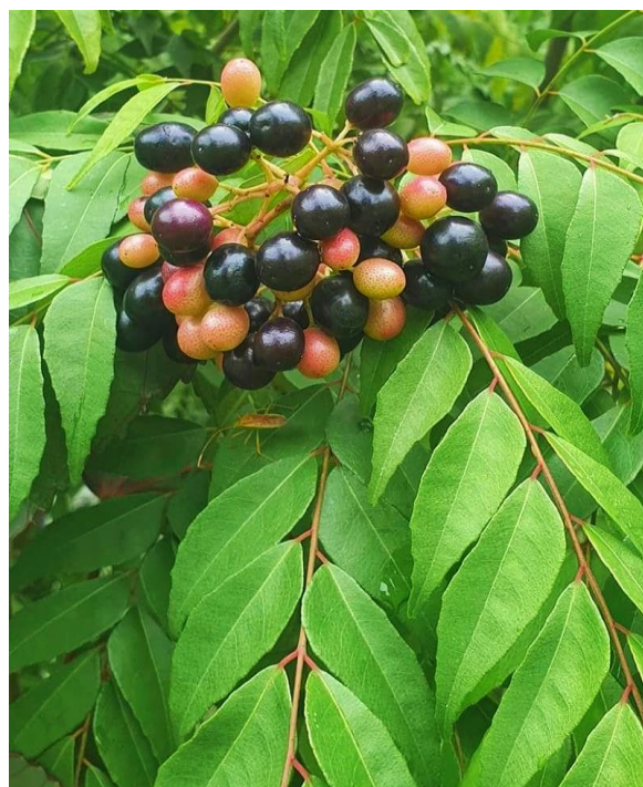
Figure 28. Murraya koenigii .

Commonly known as the curry tree, Murraya koenigii (Figure 28) is a tropical tree native to Asia and belongs to the family Rutaceae. The leaves and roots of the plant are rich in bioactive phytochemicals, including carbazole alkaloids such as mahanimbine, flavonoids, sterols, koenimbine, koenine, girinimbine and mukoeic acid, which have antioxidant, antimicrobial, anti-helminthic, anti-diabetic and hepatoprotective properties. They have been used to treat night blindness, diarrhea, dysentery, etc. [135]. According to a study conducted by Husna et al. (2018), the administration of 200 mg/kg body weight and 400 mg/kg body weight of M. koenigii extract leaves in STZ- and nicotinamide-induced hyperglycemic rats led to a significant decrease ( p < 0.05 ) in blood glucose levels compared to the standard drug glibenclamide (1 mg/kg body weight). This antidiabetic effect may have been due to its antioxidant properties and reduced insulin resistance [66]. Darvekar et al. (2011) conducted a study on the acute toxicity of petroleum ether, chloroform and ethanol extracts of Murraya koenigii according to OECD guidelines. The extracts were suspended in saline and administered orally in single doses of 500 mg/kg, 1000 mg/kg and 2500 mg/kg body weight to different groups of rats each; the rats were monitored for the next 24 h. The LD50 of the extracts was found to be 2500 mg/kg body weight [172].