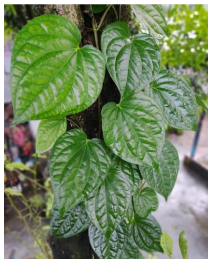
Figure 31. Piper betle .