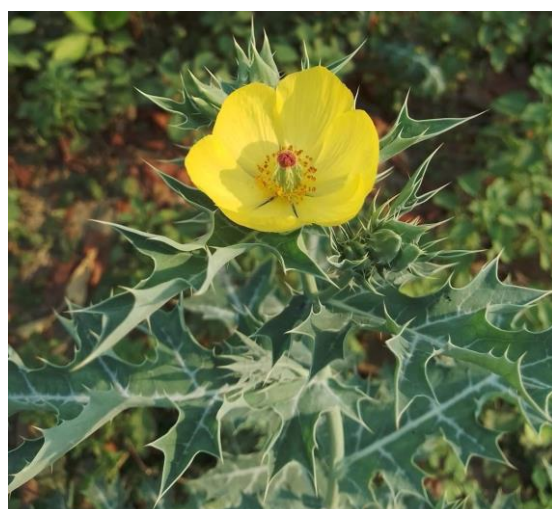
Figure 7. Argemone mexicana .