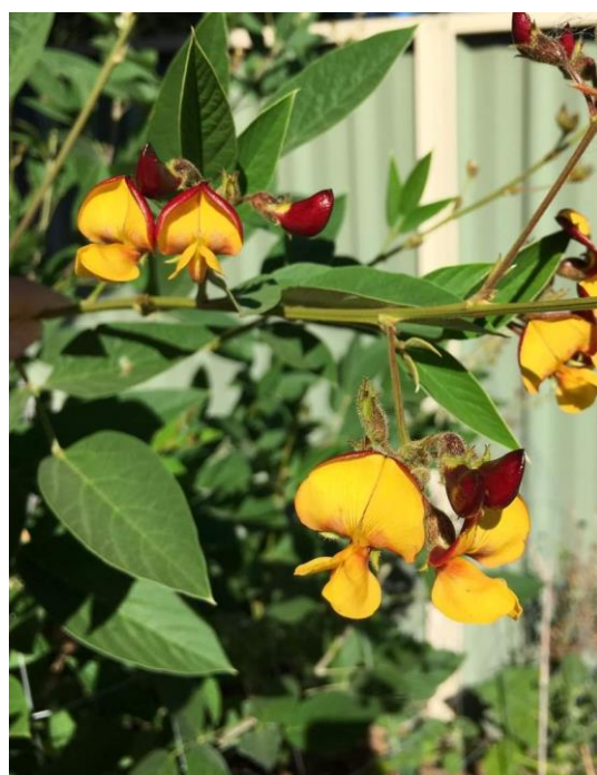
Figure 14. Cajanus cajan .