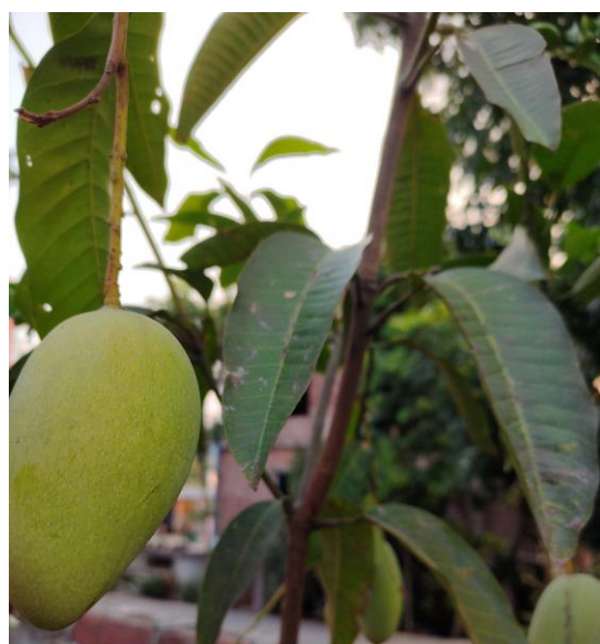
Figure 24. Mangifera indica .