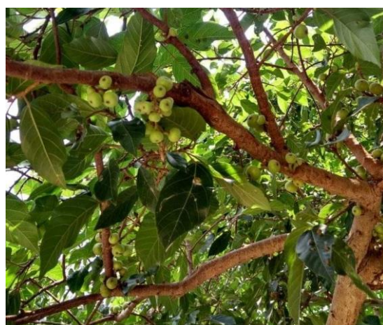
Figure 22. Ficus racemosa .