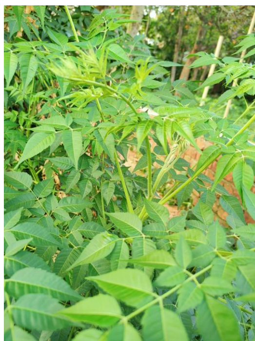
Figure 9. Azadirachta indica .