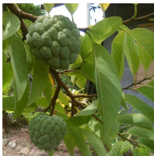
Figure 6. Annona squamosa .