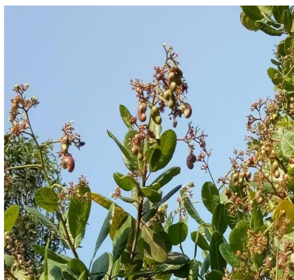
Figure 4. Anacardium occidentale .