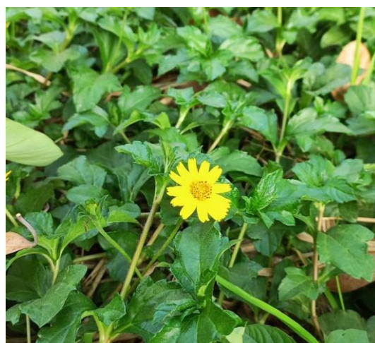
Figure 37. Wedelia chinensis .

Wedelia chinensis (Figure 37), also known as Wedelia, is a climbing wetland herb from the Asteraceae family native to India, China and Japan. Furthermore, is reported to have anti-cancer, antimicrobial, antioxidant and anti-inflammatory properties and contains flavonoids, alkaloids, saponins, phytosterols, mucilage, carbohydrates and tannins [171], [191]. Bari et al. (2020) demonstrated that the administration of 100 mg/kg and 200 mg/kg body weight of methanolic extract of W. chinensis to alloxan-induced hyperglycemic Swiss albino mice significantly reduced blood glucose levels ( p < 0.01 ), in addition to improving the lipid profiles (TG, LDL, TC, VLDL and HDL) compared to standard the drug (glibenclamide 5 mg/kg body weight) [65]. Compounds isolated from W. chinensis leaves, especially flavonoids, have significant \alpha -amylase- and \alpha -glucosidase-inhibitory activity, which is an effective mechanism for managing type 2 diabetes [192]. In a study conducted by Umasankar et al. (2010), the toxicity of the ethanolic extract from W. chinensis was investigated following the methods of Litchfield and Wilcoxon (1949). The extracts were each administered in doses of 100, 200, 400, 800 and 1600 mg/kg body weight to five different groups of mice. The mice were observed for mortality for the subsequent 72 h. The extract did not confer mortality or toxicity, indicating that the LD50 value of the extract was >1600 g/kg body weight [171].