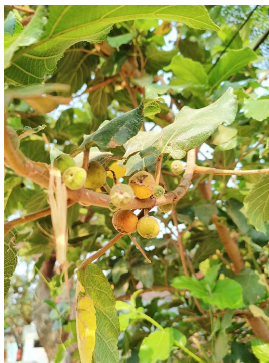
Figure 21. Ficus hispida .

following CPCSEA guideline 420. The extracts were administered to Wistar albino rats in doses of up to 1000 mg/kg body weight and conferred no mortality or toxicity [156].