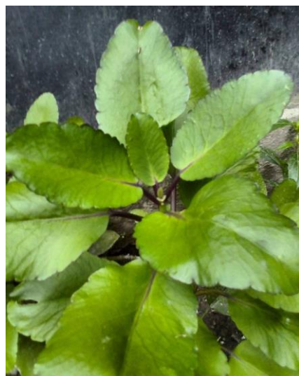
Figure 23. Kalanchoe pinnata .