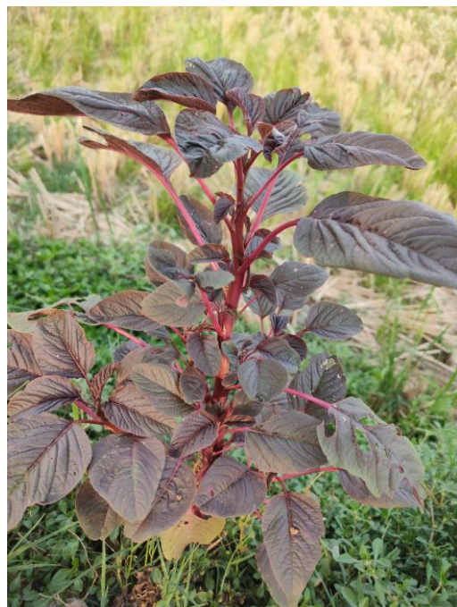
Figure 3. Amaranthus tricolor .

in diabetic rats [21]. Further studies are needed to determine the exact molecular mechanism of the antidiabetic effect. Aneja et al. (2013) conducted research in which they administered a single dose of 2000 mg/kg body weight of aqueous extract of A. tricolor roots to Wistar albino rats after fasting overnight. The animals were closely observed for signs of toxicity or mortality during the first 30 min post-treatment, periodically for the next 24 h and once daily for the next 14 days. No lethality was conferred by the extract at 2000 mg/kg body weight [19].