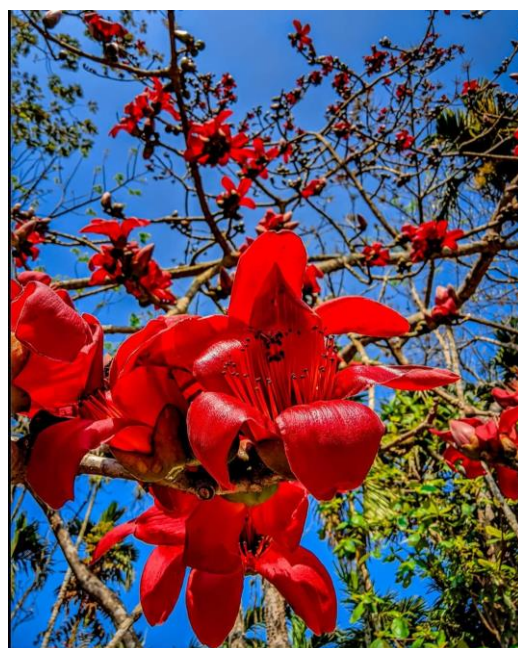
Figure 12. Bombax ceiba .