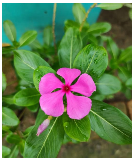
Figure 15. Catharanthus roseus Linn.