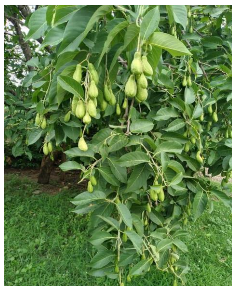
Figure 36. Terminalia chebula .