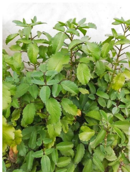
Figure 13. Bryophyllum pinnatum .

for the first 2 h and the next 24 h for signs of toxicity or mortality. The extract was non-toxic, weighing up to 2000 mg/kg [138].