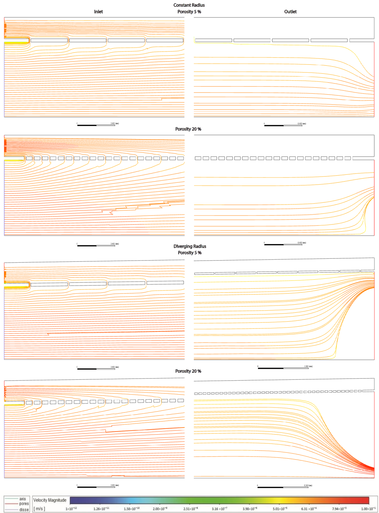
Figure S2. Streamlines at Inlet (left hand side) and Outlet (right hand side) for sinusoids modelled with lymphatic drainage. Models are with constant radius (cylinder) or with diverging radius (conical), and low (5%) porosity or high (20%) porosity.