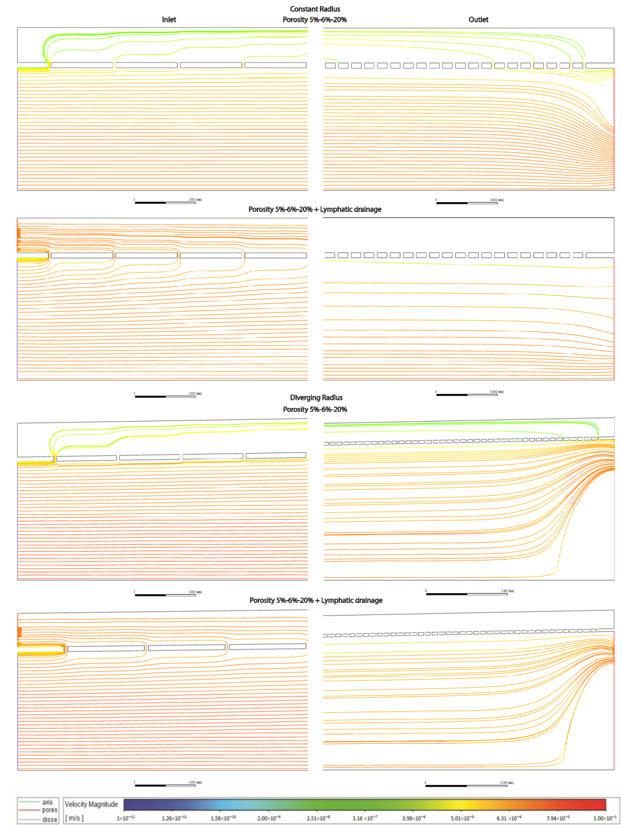
Figure S3. Streamlines at Inlet (left hand side) and Outlet (right hand side) for sinusoids modelled with variable porosity (5-6-20%), constant (cylinder) or diverging (conical) radius, and with or without lymphatic drainage.