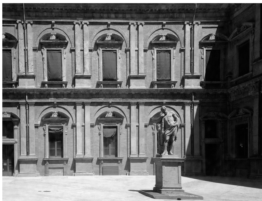
Figure 3. Internal view of Hercules' courtyard (Ferretti, Indio).

Copyright: © 2021 by the authors. Licensee MDPI, Basel, Switzerland. This article is an open access article distributed under the terms and conditions of the Creative Commons Attribution (CC BY) license ( https://creativecommons.org/licenses/by/4.0/ ).