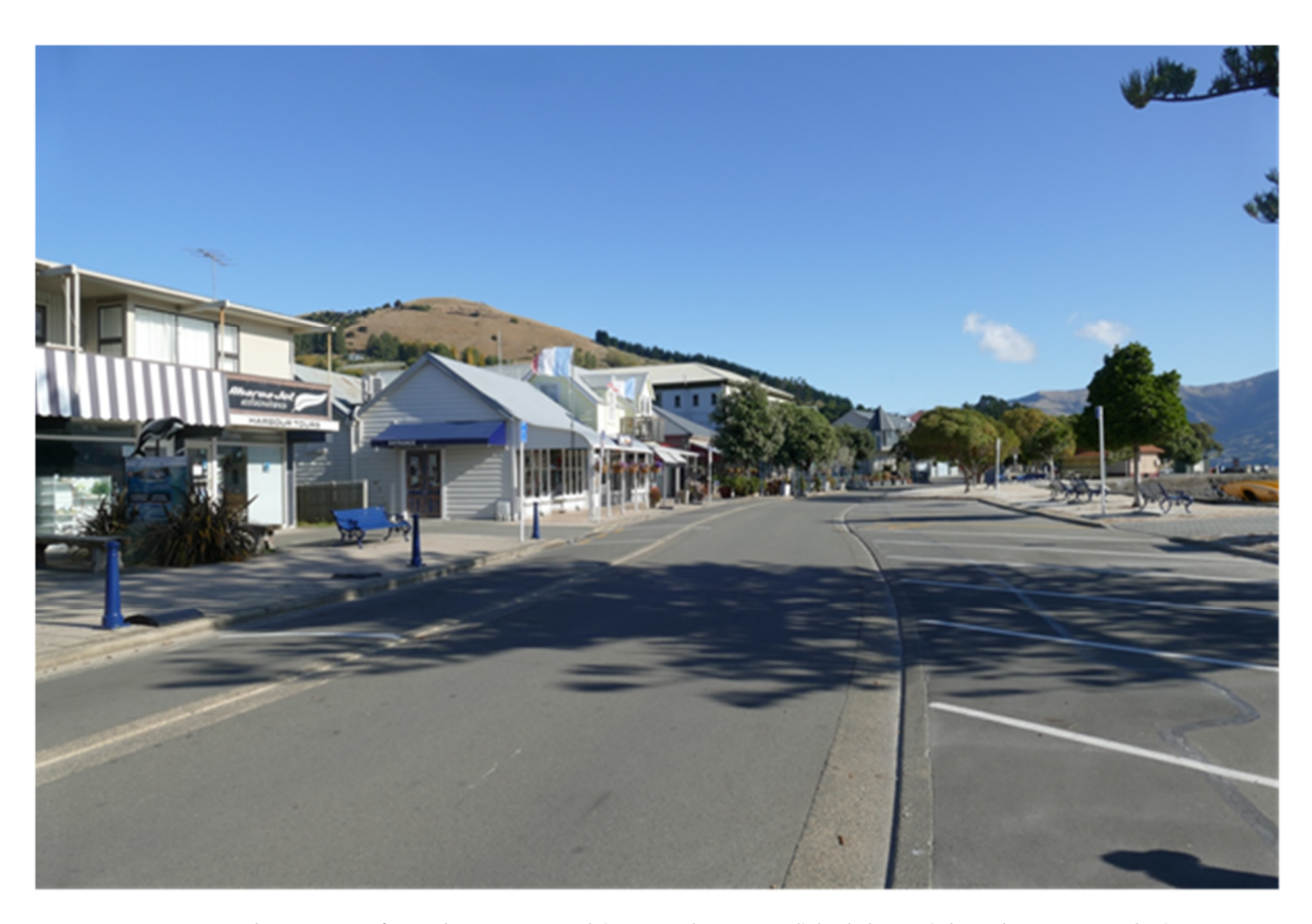
Figure 2. Akaroa waterfront during 4-tiered (25 March-27 April) lockdown.

In parallel, the popularity of tourism in Akaroa has attracted many farmers to progressively diversify towards tourism, including the Seventh Generation Tours Akaroa, Paua Bay Farm Tours, Akaroa Dolphins, and Pohatu Penguins. Similarly, a venture such as Pipi Journeys Harbour Cruise Akaroa is another example of entrepreneurs diversifying from other tourism branches such as restaurants. Tourism diversification strategies must also include off-season products and marketing. Consequently, there is a need to train local entrepreneurs and develop tourism marketing strategies by differentiating domestic and international tourists. A local tour company owner reported that "I never intended to offer local tours to the cruise ship passengers. I did it because it was easy money . . . I am now restructuring my business and focusing more on the domestic market. I think domestic tourists will have less impact on the natural environment. I will educate them about nature conservation, ecology and the importance of our heritage".