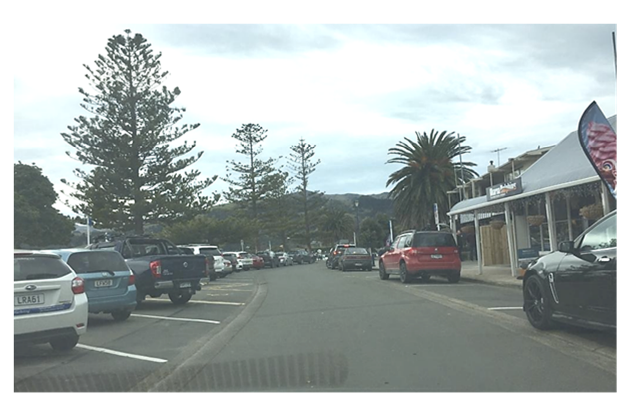
Figure 3. Akaroa waterfront after 4-tiered lockdown.