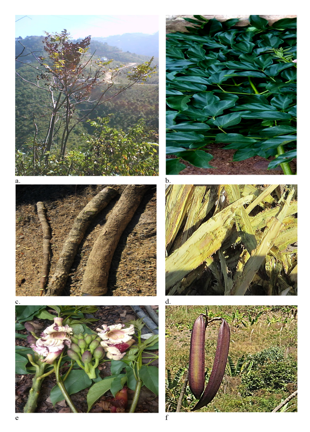
Figure 1. Oroxylum indicum: (a): whole tree; (b): leaves; (c): stem; (d): stem bark; (e): flowers; (f): fruits.

and scattered glands on the lower surface. Inflorescence of Sonapatha is an erect raceme, terminal, and 25–150 cm long, with partitioned peduncle rachis (Figure 1). Flowers are bisexual, containing 2–4 cm long pedicel, bracteolate, coriaceous calyx, and campanulate. The buds are 2–4 cm long, 1.5–2 cm in diameter, brown or dirty violet colored, containing water, and become almost woody in fruit (Figure 1). The corolla is funnel shaped, about 10 cm long with 5 lobes, subequal with wrinkled margin, reddish outside, and yellowish to pinkish colored inside. The flowers contain five stamens, inserted in the throat, hairy at the base. The ovary is superior, two-celled, and contains many ovules (Figure 1).