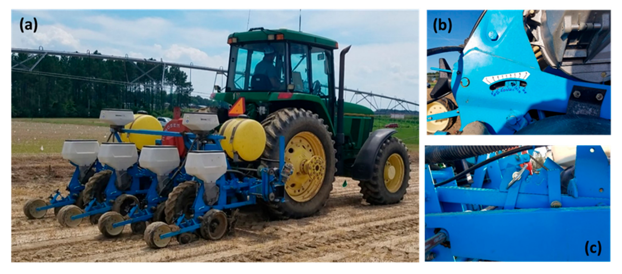
Figure 1. (a) Four-row Monosem NGPlus vacuum precision planter, (b) depth control mechanism, and (c) mechanical downforce assembly used for attaining different downforce adjustments in this study.

disengaging the arm resulted in no additional load on the row-unit other than the row-unit weight plus the weight of any seed and product in the hopper. Cotton was planted at a seeding rate of 105,020 seeds ha<sup>-1</sup> during all three years.