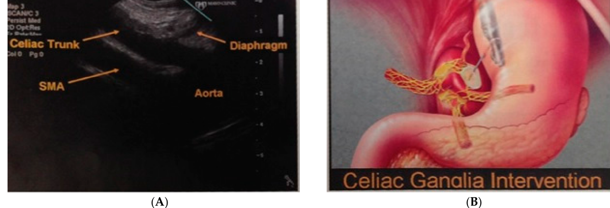
Figure 3. Endoscopic ultrasound (EUS)-guided celiac plexus neurolysis. ( A ) EUS showing the anatomic relationship between the diaphragm, aorta, celiac trunk, and the superior mesenteric artery. ( B ) Demonstration of EUS guided injection of the celiac ganglion.

Debate in the radiology literature occurs regarding the roles of celiac artery angioplasty and even vascular reconstruction. These vascular approaches do not address the role of the celiac plexus [17]. Blood flow to the stomach can occur through extensive collateral networks and multiple branches from the superior mesenteric and inferior mesenteric arteries that supplement the contribution of the celiac artery. Therefore, the therapeutic focus should be on the decompression of celiac ganglion.