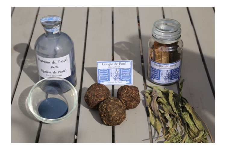
Figure 2. Dyers' woad according to the Woad Museum (Labège, France): powdered blue colouring, balls with crushed woad, and dried leaves of the Isatis tinctoria plant.

Duarte Nunes do Leão, in his Descrição do Reino de Portugal ('Description of the Kingdom of Portugal') (1610), mentioned that the Count of Portalegre, João da Silva, had successfully sown woad in a lezíria <sup>28</sup> in his territories in previous years [11] (p. 59v). In the sixteenth and seventeenth centuries, production from the Azores was both considerable and connected with large wool centres in England and the Netherlands, exchanging Portuguese woad for textiles from those regions [10]. In the mid-eighteenth century, woad from the