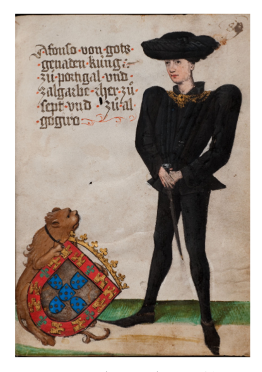
Figure 3. King Afonso V of Portugal (1432–r.1446–1481).

The fact that the Portuguese Regimento firmly established that black was to be used with the best quality cloths seems to corroborate the sumptuary nature of fine fabrics dyed in dark colours. Dark and lustrous blacks combined the apparently antagonistic variables of luxury—as a demarcation of social hierarchy—with moral edification.