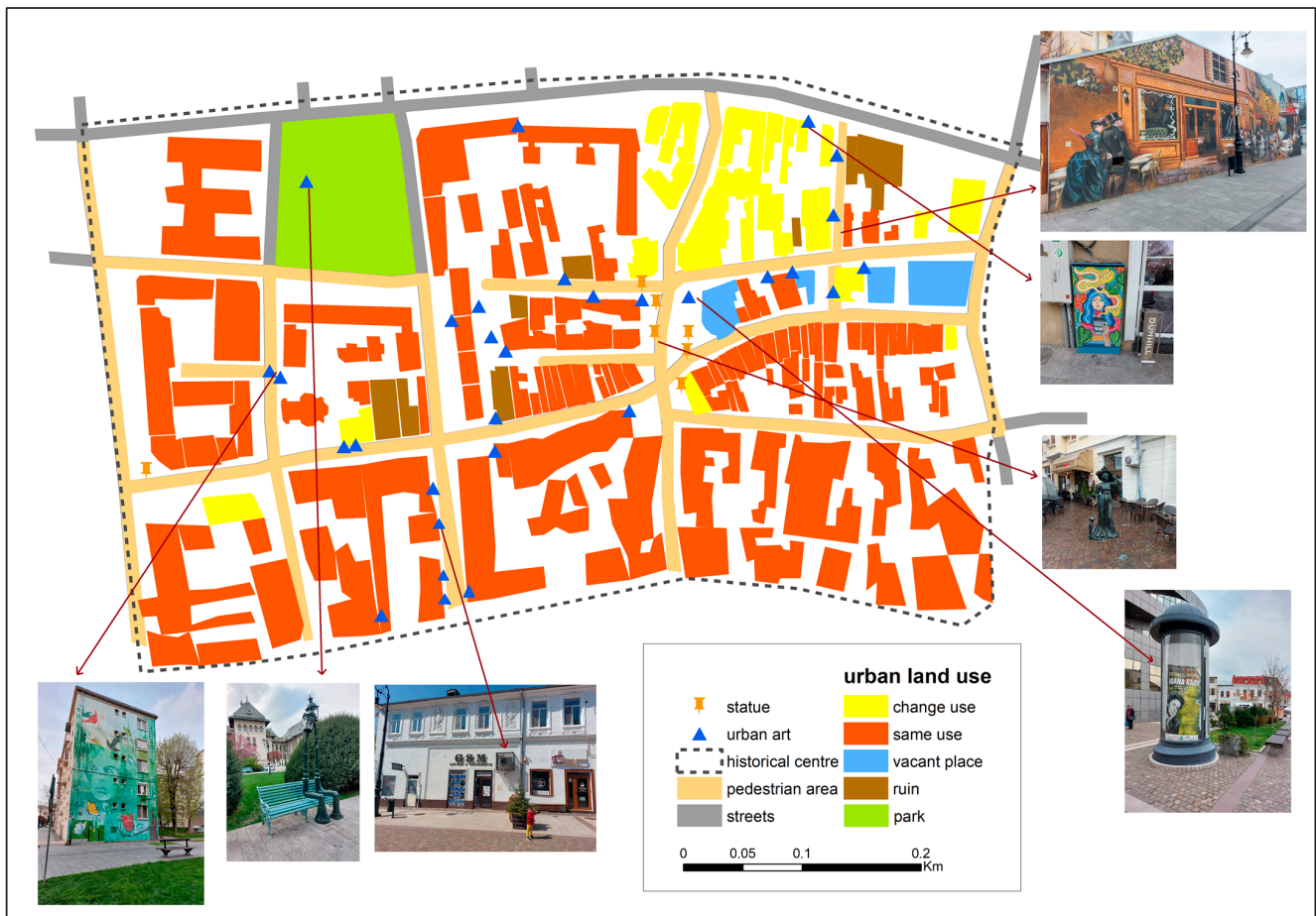
Figure 3. Patterns of museality within the city center that underwent a revitalization process.

To further add to the atmosphere of the beginning of the 20th century, there is an abundance of signs that 'enhance a historic image', with large urban paintings on the walls of some of the buildings. Moreover, even the signs of contemporary urban life (various infrastructure boxes that could not be relocated) have been painted so as to fade into the background (Figure 3).