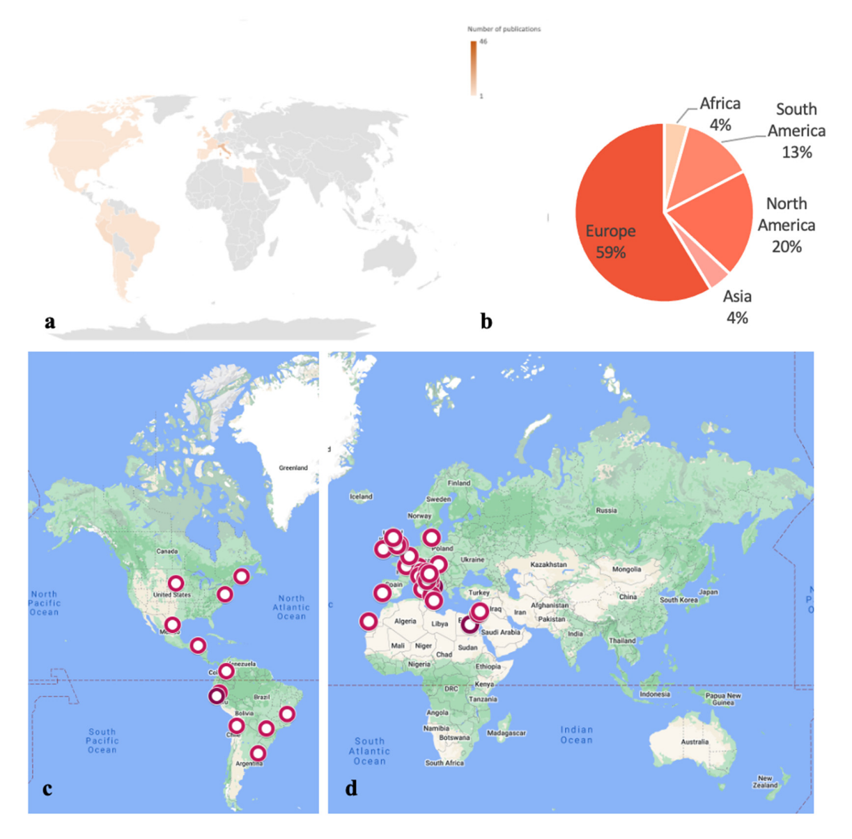
Figure 1. World map showing the number ( a ) and percentage ( b ) of archeoentomology research published at a continent level (developed via Excel<sup>®</sup>) and the locations of the excavations at a country level in North and South America ( c ), compared to the rest of the world ( d ) (developed via GoogleMyMaps<sup>®</sup>). A gradation in hue has been used to represent the number of publications per area, i.e., the darker the hue, the more publications available in the current literature.