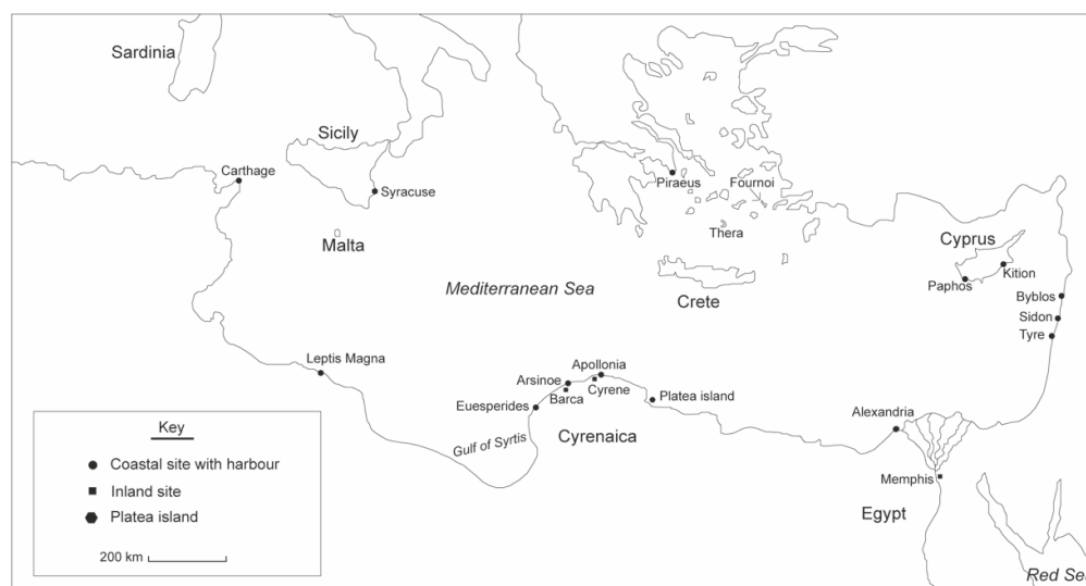
Figure 1. Map of Cyrenaica and relevant ports and cities mentioned in this text.

Cyrene and its agricultural hinterland had a favourable climate for agriculture, producing a number of products for export to the wider Greco-Roman world including wheat, a variety of legumes [13], barley, rice, onions, garlic, cumin, saffron, white violet, roses, cucumber, tree moss, grapes, and edible fungus [14,15], while animal-derived exports included livestock such as horses, cattle, sheep, goats, mules, and camels, as well as animal products including hides, ostrich plumes, and murex shells [14,15]. There is ample archaeological evidence for olive oil production in the region, including the remains of hundreds of olive oil presses, which further attest to the agricultural fecundity of this region [10]. Unlike many of the agricultural products listed above, silphium grew wild and uncultivated. Despite this impressive list of exports that fuelled the vibrant economy of Cyrene, it was silphium that was selected to appear on the silver coins of this kingdom and remained employed as the principal heraldic symbol of Cyrene on their silver coins for over three centuries [5].