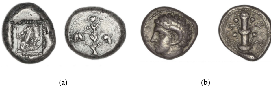
Figure 3. Silver coins from Cyrene showing how the depiction of the silphium plant changed over time. (a) Silver coin of Cyrene, c. 525–480 BCE depicting silphium plant (obverse) and lion devouring prey (reverse). Museum number 1971,0513.12. (b) Silver coin minted at Cyrene depicting the head of Ammon (obverse) and silphium plant (reverse), c. 435–375 BCE. Museum number 1928,0120.98.

In Figure 3a, a relatively early rendering of the entire silphium plant is shown. This may be a more naturalistic depiction as this version shows the stalk alternately tending towards the left and then the right, while the leaves are depicted opposite the umbels. An umbel is defined as a flower cluster where stalks of equal length emanate from a common centre, as is characteristic of the parsley family of plants. Later depictions of the silphium plant are markedly different from this early rendering.