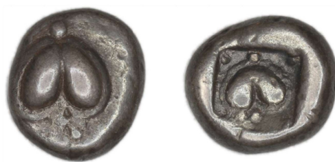
Figure 2. Silver coin of Cyrene, c. 525–480 BCE. Museum number RPK,p97E.1.Car.

Our primary sources of information on the morphological attributes of silphium derive from numismatics [14], and to a lesser extent, terracotta figurines from Cyrenaica that typically depict a female figure holding a silphium stalk. The silver coins of Cyrenaica were thoroughly catalogued, with the earliest dating from c. 560 BCE [5]. Silphium, be it the entire plant, a fruit, flower, leaf, or seed, almost invariably appears on the obverse, and sometimes is duplicated on the reverse of these coins [5]. The fruit was the first element of the plant depicted on the earliest coins, replaced by other parts of the plant in later periods [5]. The silphium fruit was depicted as ‘heart’ shaped (Figure 2).