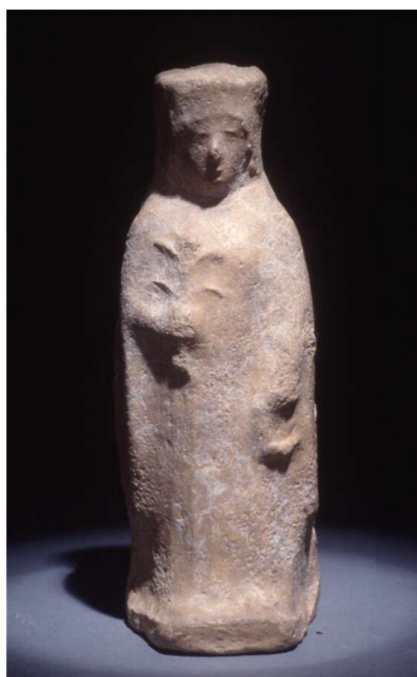
Figure 5. Mould-made terracotta figurine depicting Cyrene as a woman holding a stalk of silphium in one hand and a sickle in the other. Museum number 1879,0405.2. Height 14.5 cm.

Herodotus described Cyrenaica as being defined by its silphium in the passage that stated, ‘ Here the country of silphium begins, which reaches from the island of Platea to the entrance of Syrtis ’ [9]. This passage suggests an exclusive connection between Cyrenaica and silphium, not shared by other regions in North Africa, or indeed other parts of the Greek world.