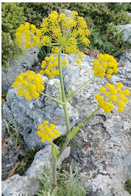
Figure 4. Modern Ferula tingitana plant.

to a gradual shift towards a less realistic and more stylised artistic rendering of the plant. This variety in renderings may simply be a function of phases in artistic styles, which may have previously favoured more realistic depictions of plants, animals, and people, while in subsequent phases, idealised renderings became more commonplace. As this later style of depicting the silphium plant is more widespread, with greater numbers of coins surviving that show this later style, we argue that this may have altered the perception of the gross anatomical morphology of the silphium plant in the minds of those seeking living relatives of the silphium plant in modern times. It is our opinion that the earlier version shown in Figure 3a more accurately reflects the shape of the ancient silphium plant due to this version showing greater similarity to modern Ferula species (Figure 4).