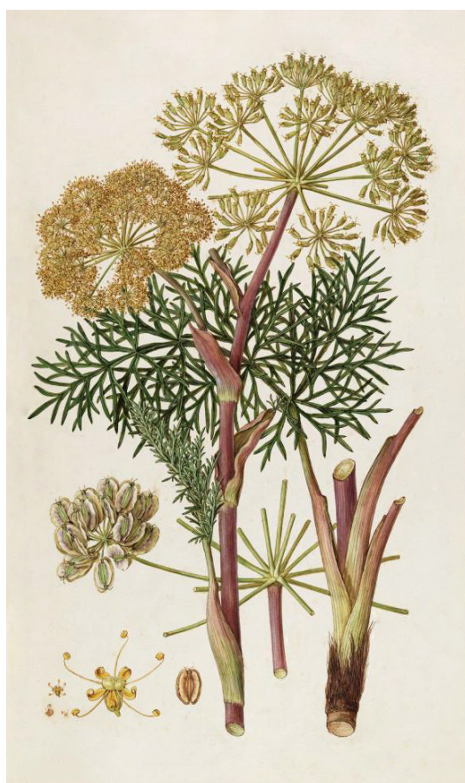
Figure 6. Drawing of Thapsia garganica by Baur. Creative Commons.

Depending on the genetic background for silphium, the relationship between these candidate plants and the elusive silphium of Cyrene could be either species in the same taxonomic family, hybrids, or the silphium itself, hiding in plain sight. Perhaps the silphium plant of Cyrenaica simply evolved to contain fewer of the properties that made it desirable and was increasingly replaced in use by cheaper substitutes from the East.