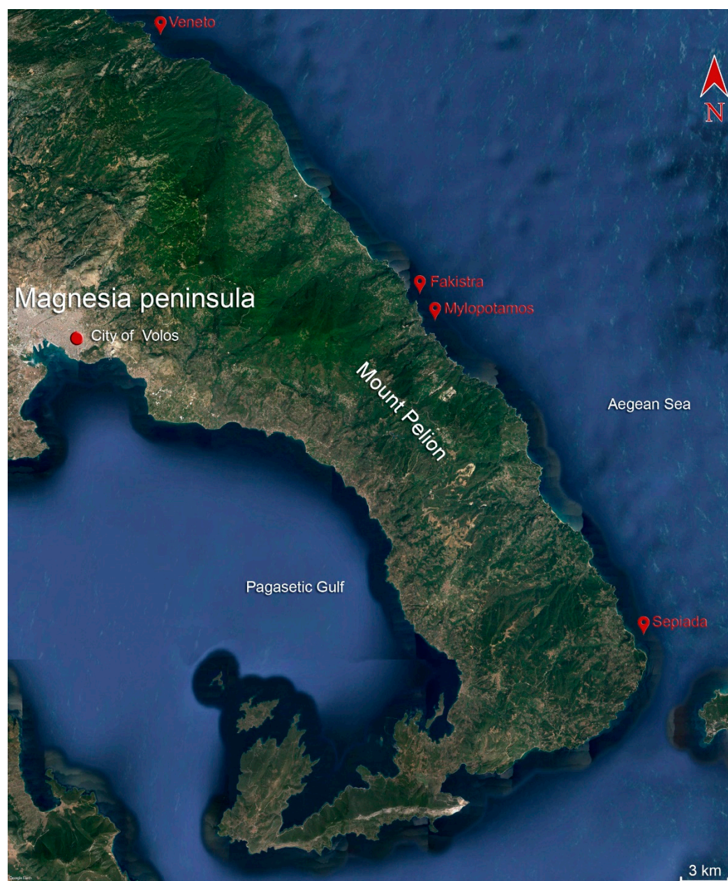
Figure 1. Magnesia peninsula with Mount Pelion area between the Aegean Sea to the East and Pagasetic Gulf to the South.

The mountain range of Pelion (1624 m) (Figure 1) is located in eastern Thessaly and extends in a NW-SE direction between the Aegean Sea to the east and the Pagasetic Gulf to the south, creating a natural barrier to the direct communication of the Pagasetic with the North Aegean Sea [35]. Pelion, along with a series of low hills to the south, forms the picturesque peninsula of Magnesia. Its verdant slopes are dominated by the beech forest and formations with poplars and willows, while the maquis reaches the rocky shores [36].