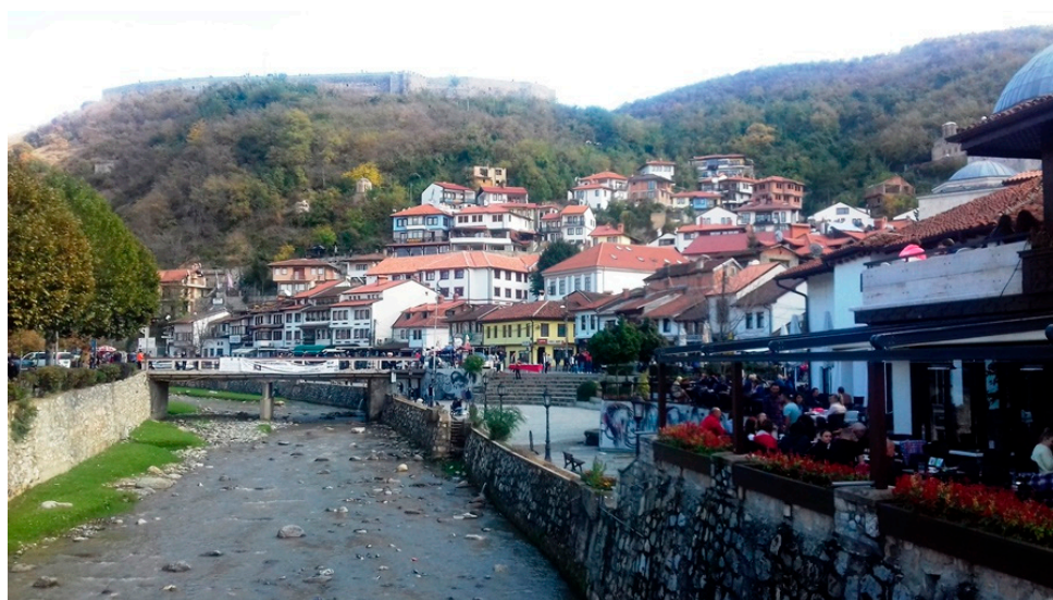
Figure 1. Historic centre of Prizren as urban heritage. Photo: Lorika Hisari (2018).

Prizren is traditionally home to diverse cultures, religions, and heritage. The old centre of the town is located in an area with specific natural terrain configurations and the urban fabric, its values not only being associated with single buildings (culturally diverse and mostly concentrated in this zone) but also as a living urban heritage (Figures 1 and 2) [53,54]. These elements and their strong implications to a collective memory of the citizens presented an extraordinary challenge for drafting of a law that ensures the preservation by a controlled planning and development without affecting the spirit of a harmonious coexistence between different religions and communities.