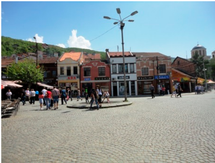
Figure 2. Historic centre of Prizren, Shadërvan square.

As the IMC was not set in place, the drafting process was in the hands of the Kosovo government. In January 2010, an inter-ministerial working group was established for initial drafting of the law on the historic centre. According to the government decision [55], members of the working group were representatives of the Ministry of Environment and Spatial Planning, the Ministry of Culture, Youth and Sports, the Municipality of Prizren, Kosovo Institute for Protection of Monuments at the national level, the Prizren Institute for Protection of Monuments at local level (now Regional Cultural Heritage Centre of Prizren), and the Ministry of Local Governance Administration. During the drafting process, the group expanded not only through formal participation of local and international experts but also through consultations and close cooperation such as with CHwB Kosovo Office, including with the UN Habitat Kosovo Office. The drafting process was supported by the ICO's Community Affairs Unit, the Office for Religious and Cultural Heritage.