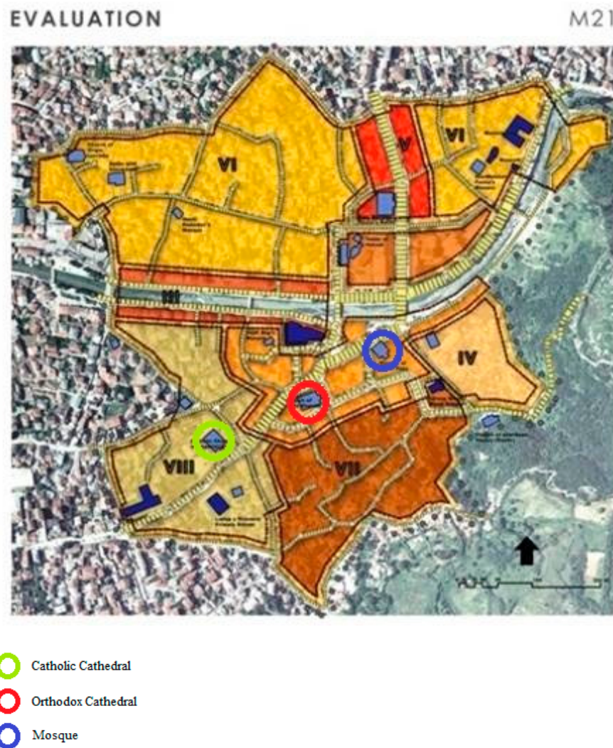
Figure 3. Prizren historic area according to the Prizren Historic Area Conservation and Development Plan (2008).

Therefore, the key principle of the law was to ensure development in a controlled manner that would contribute to the preservation of the unique character of the area. This is also an essential requirement of the CSP Annex V and the Law on Special Protective Zones. Following the local urban, social, and cultural characteristics, the working group decided that the protective zone of the historic centre of Prizren would be a wider zone based on the following two main principles: (I) To provide technical criteria for its controlled planning and development in order to preserve the urban heritage and the spirit of the place and (II) to ensure that all communities attached to it are included in the process of planning and development.