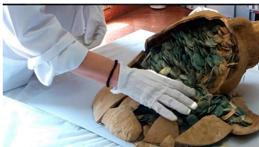
Figure 2. Coins found in Tomares (Seville). One of the amphorae containing coins (photo by the author).

In 2016, in Tomares (Seville), during works to adapt a park, workers found a set of 19 amphorae filled with Roman coins dating from the third and fourth centuries A.D. [36] There were more than 50,000 in all (Figure 2). The find was widely reported in the media. 3 [37] Although initially no economic estimates were given, it was soon revealed that the Museo Arqueológico de Sevilla [Archaeological Museum of Seville], to which the coins had been turned over, considered that, as the coins were folles of the emperors Diocletian, Constantine, and Maximian, with a unit price at Sotheby's of £60 and on eBay of €60, the finders were due an enormous fortune. 4 Although the case has not yet been settled, these reports clearly point to major misconceptions.