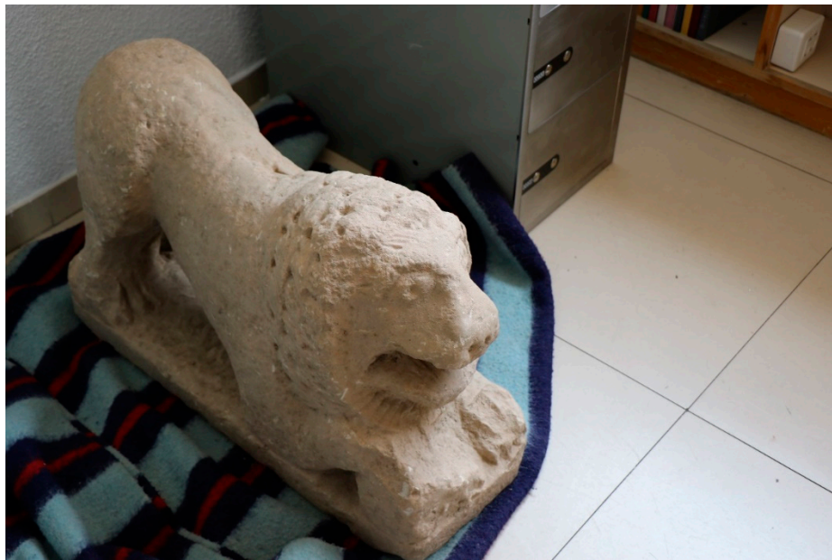
Figure 3. ‘Operation Quedada’. Iberian-Roman lion sculpture seized by the National Police.

Unfortunately, such cases are exceptional. In practice, valuation reports for archaeological objects, in both criminal and administrative proceedings, largely remain devoid of convincing rationales for the established amounts. Instead, exploiting the need for the authoritative criteria of specialists, they provide ‘oracular’ answers, offering no supporting evidence, justification or reasoning for the opinions they contain. The acceptance of these expert reports, which fail to fulfil the basic purpose of any report [45] in judicial or administrative proceedings, can only be understood as the result of a lack of familiarity with the topic by judicial and prosecutorial authorities. In the aforementioned case of the lion, in mistakenly associating the market price with the value of the damage, the Museo Arqueológico Nacional depreciated the piece’s economic value. This was recalled in judgement 46/18 of Criminal Court No. 5 of Granada, which tried the case and sentenced the defendants to two years in prison and the definitive confiscation of the lion to be handed over to the Andalusian government.