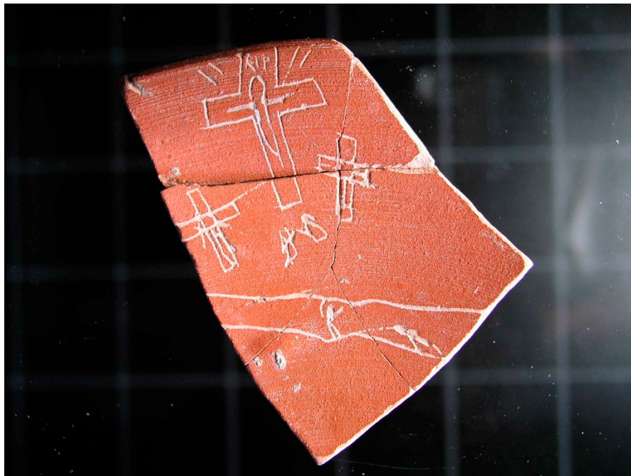
Figure 4. Fake ostraca from the Iruña-Veleia site (Vitoria, Spain).

Of interest here is the expert report assessing the value of the damage. For the experts at the Diputación Provincial, each amorphous sherd of Roman pottery or animal bone that was engraved has an economic value of €600, bringing the overall cost of the damage to a total of between €240,000 and €270,000.