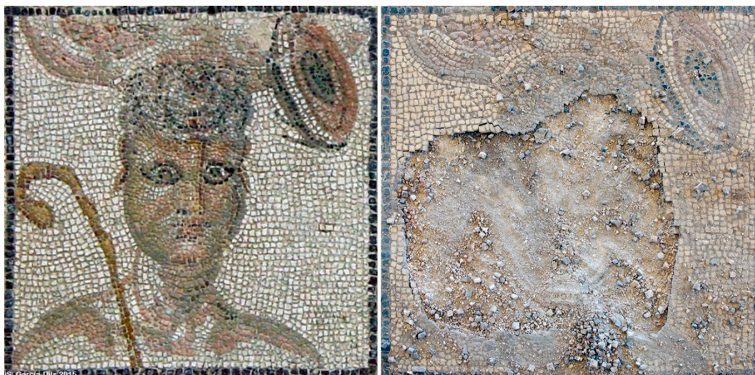
Figure 6. Damage to the mosaic in Plaza de Armas in Écija (Seville, Spain).

theme dating from the second century AD (Figure 6). The central panel ( emblema ), skilfully made from tiny stone and glass-paste tesserae ( opus vermiculatum ), with a rich polychromy and accomplished shadow play, depicted a dual image, depending on the observer's point of view. From the north of the room, it showed a youth carrying a pedum , or shepherd's crook, over his right shoulder; from the south, it showed a bearded old man carrying a characteristically fringed tympanum , or Bacchic tambourine, in his right hand. The Court of First Instance and Examining Magistrates' Court of Écija opened preliminary inquiry no. 273/2015, asking the Conjunto Arqueológico de Carmona to assess the value of the material damage caused to the site and the costs of repairing it.