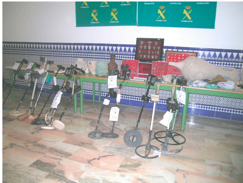
Figure 1. ‘Operation Tertis’. Metal detectors seized by the Guardia Civil.

To date, the most spectacular operation has been ‘Operation Tertis’, in which the Guardia Civil [Civil Guard] seized more than 300,000 archaeological objects [26,27] (Figure 1). However, this approach met with little judicial success, as the judges considered that the prosecution had failed to prove with sufficient clarity the commission of any criminal wrongdoing. The investigation had focused on collections, but lacked ‘proof of provenance’ or proof that the seized objects were the product of archaeological looting for which the statute of limitations had not run out.