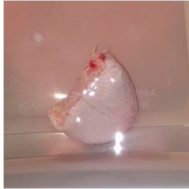
Figure 1. The amputated anterior third of tongue was brought to the emergency department (ED) in a plastic box containing tap water.

A 55-year-old male attended the ED at the Royal United Hospital, Bath, UK after sustaining trauma to his tongue. His presenting complaint was that a person known to him was alleged to have bitten off a large piece of his tongue. This significantly sized, amputated portion of tongue was brought to the ED with him in a plastic container containing tap water (Figures 1 and 2).