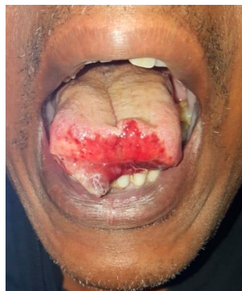
Figure 2. The patient following presentation to the ED after an alleged human bite to the tongue.

A primary survey revealed that he did not present an airway risk, he was able to talk in full-sentences and there was no major haemorrhage present; his national early warning score was 0. Therefore, a thorough history of the presenting complaint and medical and social histories were taken. These revealed that the injury had occurred 14 hours prior to ED attendance and subsequent to the voluntary ingestion of a “third of a pink pill” outside of a night club, in the early hours of the morning.