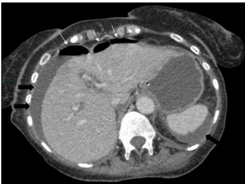
Figure 3. Axial CT scan of the abdomen showing free air anterior to the liver (white arrows) and free fluid around the liver and spleen (black arrows).

arterial lactate level. An erect chest x-ray revealed free air under the right hemidiaphragm. Following initial resuscitation and administration of antibiotics, a CT was performed revealing the known pseudocyst with anterior compression of the stomach, free fluid in the abdomen and considerable free intra-abdominal air (Figures 3–5).