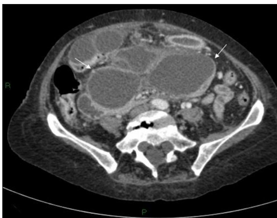
Figure 2 Axial post-contrast CT scan of the upper abdomen showing the inferior aspect of the cyst with bi-lobed appearance (arrows) in the pelvis.

Advice from the regional hepatico–pancreatico–biliary (HPB) unit was for conservative management until the walls of the pseudocysts matured, when open drainage and cholecystectomy could be considered if symptoms did not resolve.