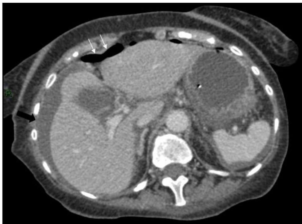
Figure 4. Axial CT scan of abdomen showing free air anterior to the liver (white arrows) and free fluid around the liver and spleen (black arrows).