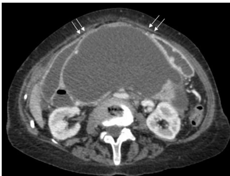
Figure 1. Axial post-contrast computed tomography (CT) scan of the upper abdomen showing a large pancreatic pseudocyst with the stomach (arrows) stretched anteriorly over it.