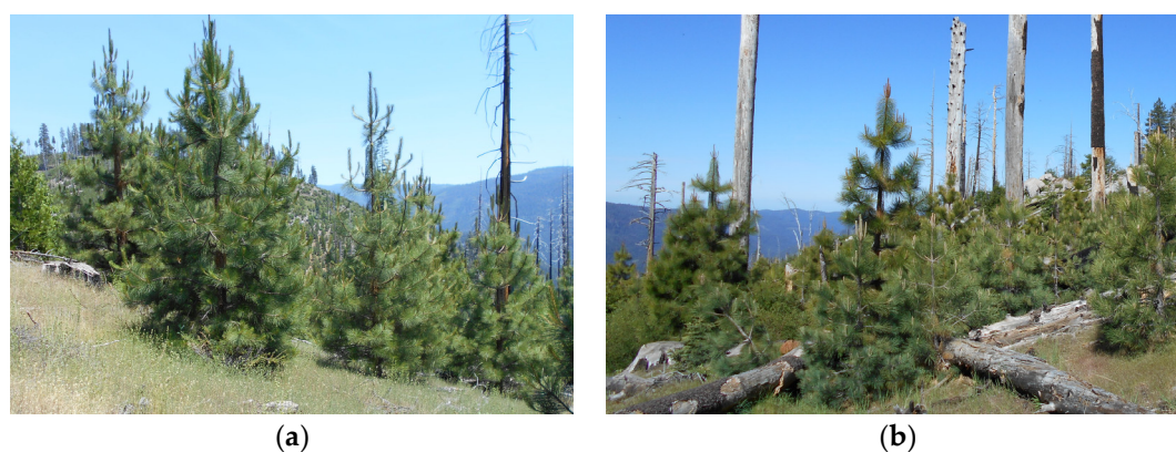
Figure 4. Comparison of a traditional, evenly spaced plantation (a), and a novel clustered arrangement (b) in the mixed-conifer forest region of the Sierra Nevada, Eldorado National Forest.