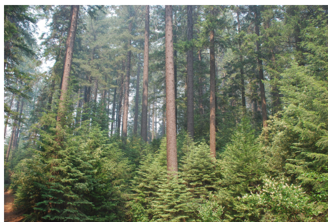
Figure 3. A fire-suppressed mixed-conifer stand in the Sierra Nevada region of northern California. The overstory is dominated by sugar pine and ponderosa pine. The stand contains a dense understory of shade tolerant, fire sensitive white fir, and incense cedar.