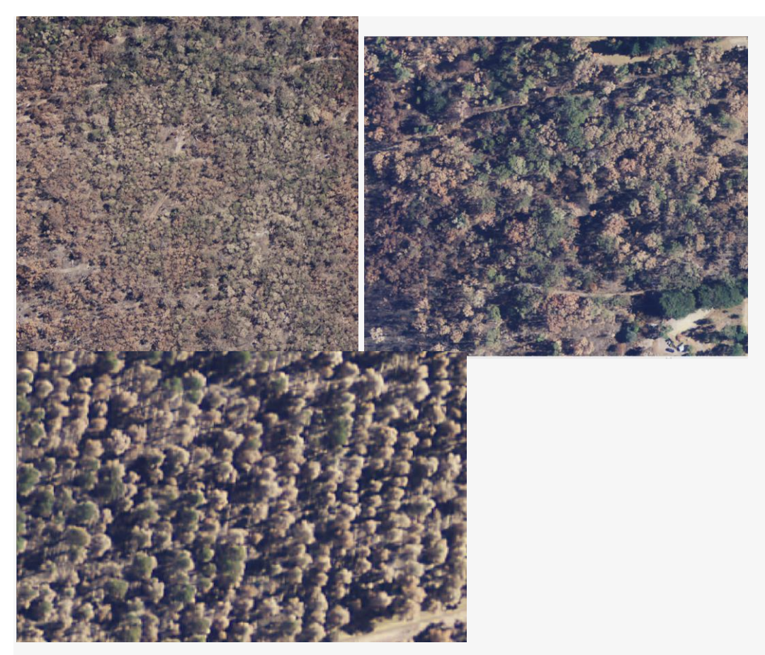
Figure S2. Intermittent crown scorch class on the aerial photography.