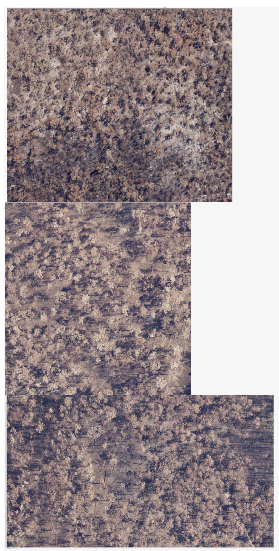
Figure S3. Intermittent crown fire class on the aerial photography.