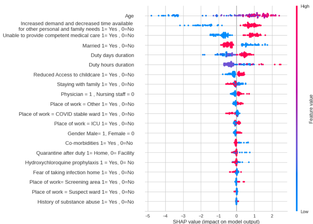
Figure 2. Factors associated with stress in decreasing order of magnitude illustrated using SHAP values.