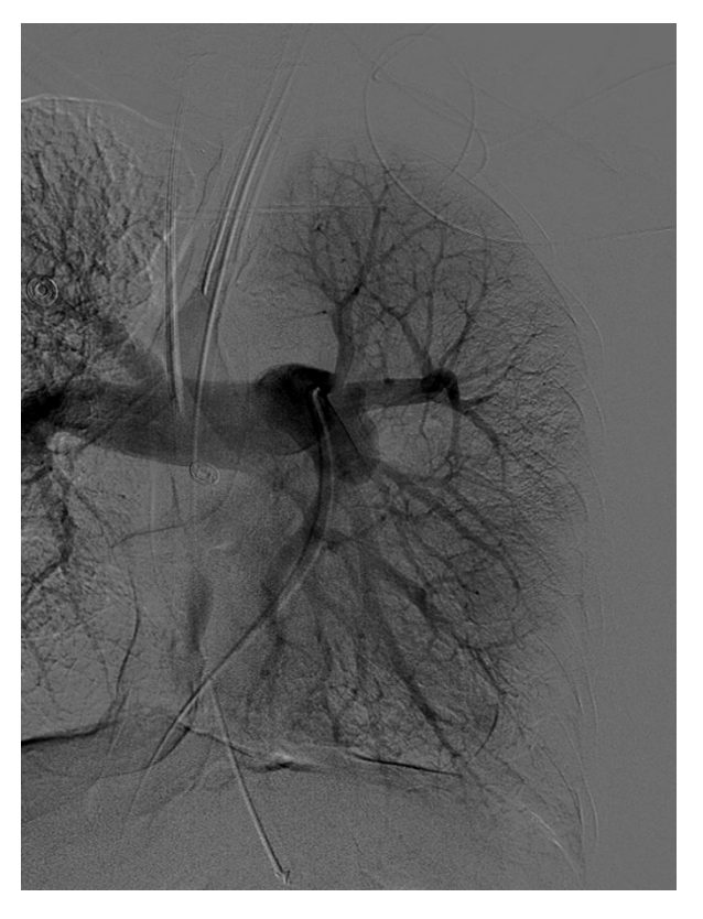
Figure 4. Post-embolization angiography of the left upper lobe of the lung demonstrating resolution of the bleeding pulmonary artery

Rasmussen's aneurysm is a pseudo-aneurysmal dilatation of a branch of pulmonary artery adjacent to a tuberculous cavity that can rupture and cause massive hemoptysis. As a tuberculous cavity begins to extend into the pulmonary artery, granulation tissue begins to invade and replace the adjacent pulmonary arterial wall (specifically the tunica adventitia and tunica media). Fibrin replacement of the vessel wall leads to thinning, and eventually herniates into the lumen of the vessel creating a pseudoaneurysm [5]. This pathology is reported to be associated with 5% of all tuberculous cavitary lesions [6]. The advent of contrast-enhanced CT has enabled a noninvasive, first-line method of localizing the site of arterial bleeding in the setting of massive hemoptysis, as seen in our case [7]. In our patient, both fiberoptic bronchoscopy and CTPA helped to identify the