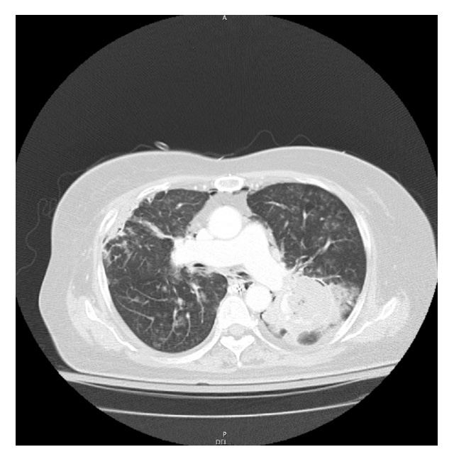
Figure 2. Transverse CT of the chest showing the lung window of a left upper lobe cavitation in direct contact with the left lower branch of the pulmonary artery

there was a high suspicion that the hemoptysis was secondary to TB infection. Pulmonary TB presents with a variety of symptoms, which are usually insidious in onset and progression. Symptoms include low-grade fever, night sweats, cough, weight loss and mild hemoptysis that usually persist for weeks before patients seek healthcare. Rarely, patients can present with massive hemoptysis, which has a mortality rate up to