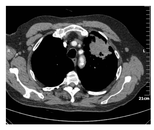
Figure 2. Chest Computerized Tomography (CT) confirmed the presence of a pulmonary mass in the left upper lobe