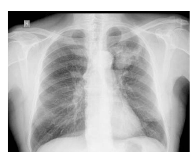
Figure 1. Chest X-ray revealed a nodular opacity in the left upper lobe and calcification along the right anterolateral aspects of the vertebral bodies of the thoracic spine

(Figure 1) showed a tumor-like opacity in the left upper lobe and calcification along the right anterolateral aspects of the vertebral bodies of