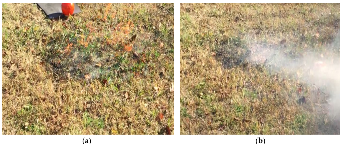
Figure 4. (a) Short grass fire before explosion; (b) short grass fire after explosion.

The fire was completely extinguished by means of the fire extinguishing ball. Considering the fact that the ball used for this experiment was the cheapest and smallest version of the fire extinguishing balls available at the marketplace, we believe that assisting firefighters during wildfires with fire extinguishing balls looks promising for the future. The 0.5 kg size ball extinguished a circle of 1-m diameter wildfire in our experiments, yet the 1.3 kg balls are claimed to extinguish a radius of 1.3 m.