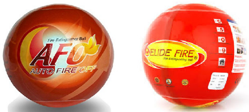
Figure 2. AFO and Elide fire extinguishing balls [8,9].