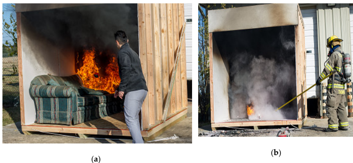
Figure 3. (a) 'Class A' fire in the demonstration cell for the case study; (b) 'Class B' fire in the demonstration cell for the controlled experiments.

The second part of the experiments focused upon wildfires; specifically for short grass fires coded as "1" in Figure 1. As aforementioned short grass fires cause a very high rate of spread (chain/hr) with low heat per unit area (Btu/ft 2 ). The three other main vegetation types presented in Figure 1 (timber litter, short needle litter, and chapparal) were not included in these experiments, but will be encompassed in further studies to complete the testing of the conceptual design. Under direct observance of the local fire department, short grass fire was started for two experimental trials. Once the grass fire reached around one meter diameter, 0.5 kg AFO ball was pushed into it by firefighters. See Figure 4 for the short grassfire experiment. Both trials were conducted at the same time of the day in the afternoon to ensure equal temperature and humidity conditions between trials. If the fire extinguisher ball exploded but was not able to extinguish the fire, or if it did not explode and the short grass fire passed an approximate area of two meters in diameter, the fire was going to be intervened by traditional methods by the firefighters. These conditions were set by the fire department to ensure safety of the experiments.