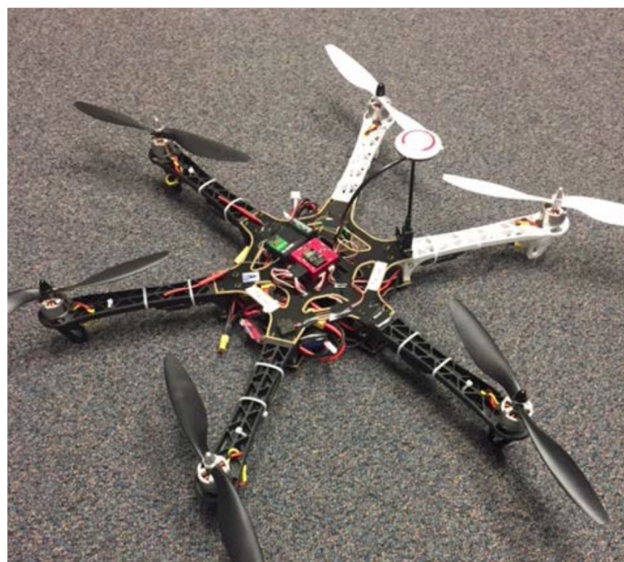
Figure 5. Scouting unmanned aircraft system (UAS).