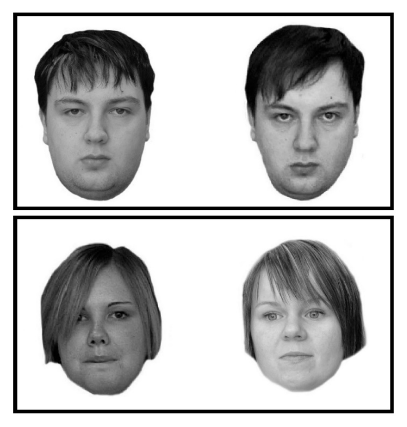
Figure 1. An example pair of faces from the Glasgow Face Matching Test (GFMT) [21]. In the top row, two different images of the same person are presented (i.e., an identity match), whereas the bottom pair depicts two different people (i.e., an identity mismatch).

This latter process is conventionally investigated via face-matching tasks [19,20], in which participants view two side-by-side face photographs, and decide whether they depict the same person, or two different individuals [21,22]. Stimuli in these tasks typically consist of high-resolution images of faces that are matched in terms of expression, pose, and lighting (see Figure 1). In addition, pairs of photographs that depict the same person are often taken just minutes apart, to minimise the natural variability that can arise within a person's appearance over time. Under these conditions, which are designed to maximise identification accuracy, viewers make around 20% errors [21].