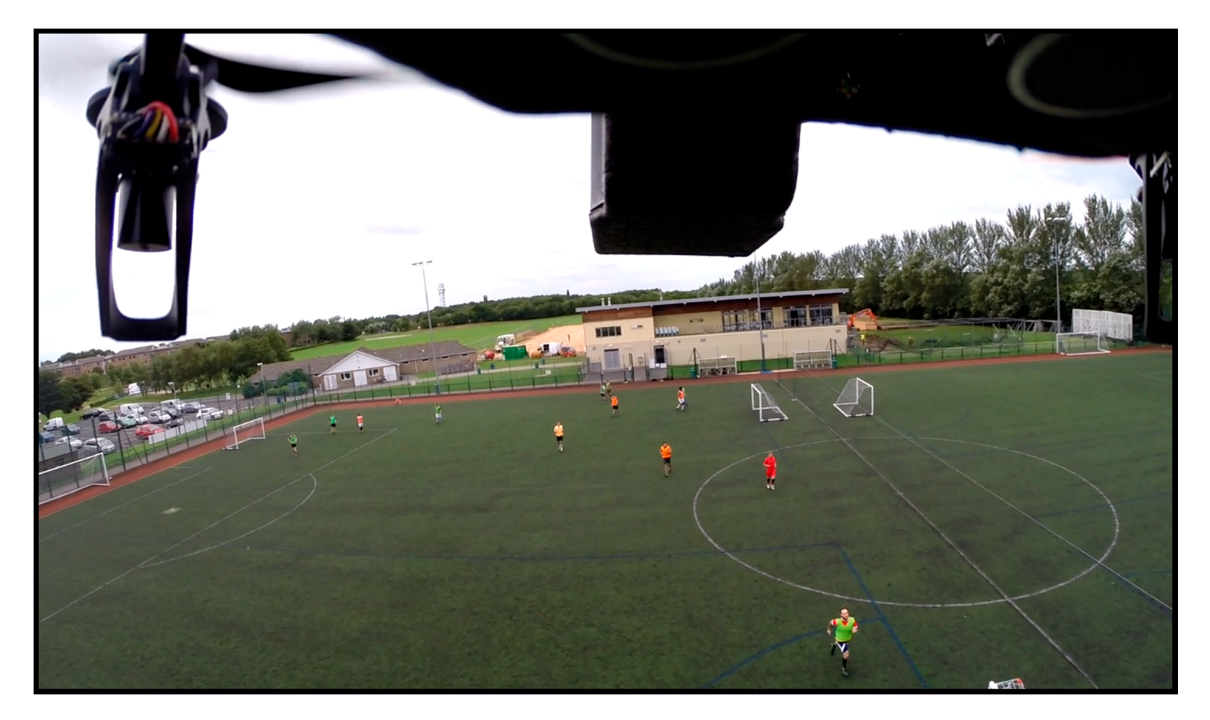
Figure 3. An aerial view from the perspective of the drone employed by Bindemann et al. [47].

To date, only one study has directly investigated the extent to which person identification by humans is possible from still images and video footage that were gathered using an aerial drone [47]. In this study, a Parrot AR drone with a minimum take-off weight (MTOW) of 300 g was used to record 14 male adults playing a game of football (soccer). According to NATO taxonomy, this type of drone would fall into Class I (b), which describes minidrones that are deployed for person surveillance and target acquisition [5]. An aerial view from the perspective of the drone can be viewed in Figure 3. In addition, a close-up high-quality digital face photograph was obtained of each person on the same day.