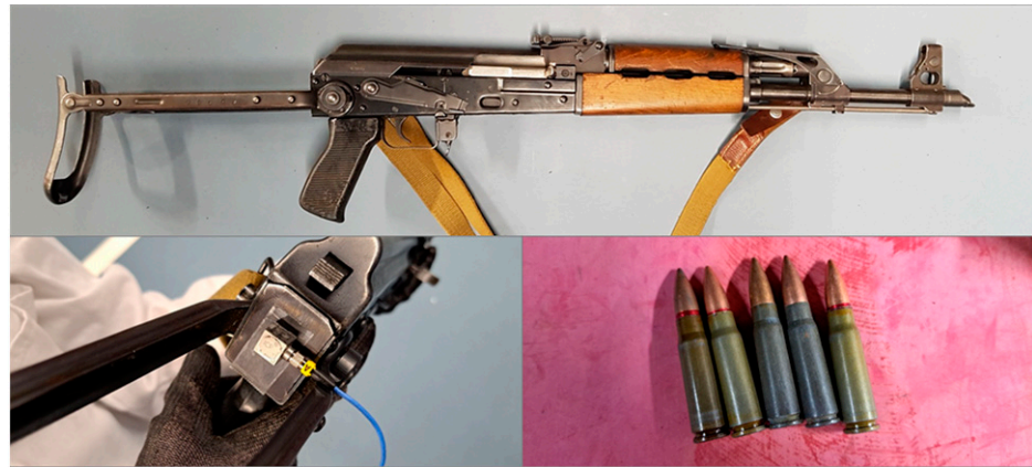
Figure 1. Measurement of vibrations emitted by a Zastava M70 AB2 automatic assault rifle. Top: rifle overview; bottom left: accelerometer positioning; bottom right: 7.62 × 39 mm M43 rounds.