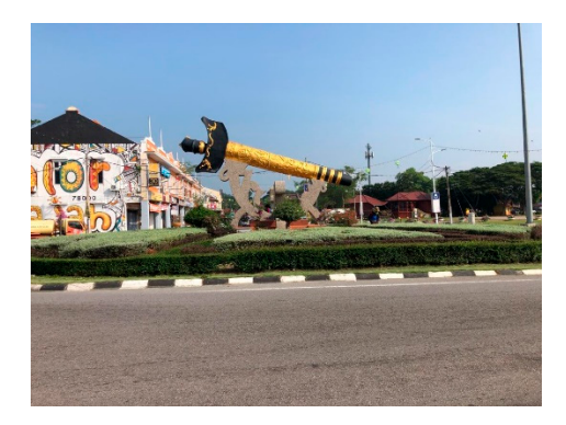
Figure 1. The Keris replica in Alor Gajah town.

Teknologi MARA Cawangan Melaka collaborated to create a mural art project to enhance the town's image [11]. Several old shop houses' walls are decorated with drawings that feature cultural themes to create a new image and unique experience, for the local and foreign visitors. AGMC began work on a development plan to upgrade a public courtyard in the heart of Alor Gajah town in 2020. In order to maximize the use of the public courtyard, AGMC decided to relocate a huge traditional Malay dagger replica known as Arca Keris to an adjacent roundabout (see Figure 1). Additional accessories, such as a new concrete base design, lighting, and landscaping were added to the final upgrade work in August 2020. Despite AGMC's efforts, no empirical study has yet been conducted on the Arca Keris in Alor Gajah, especially in terms of design and appeal. Scholars argue that very few public artworks are examined after they are displayed, which raises concerns about whether their design and appeal can reach the highest standards [2]. As a matter of fact, most public artworks in various Malaysian states are typically misinformed; hence, they fail to improve the quality of life as intended [6]. Taking into account all of the reasons for and against public art installations, this study intends to examine Arca Keris in Alor Gajah and answer the following questions: (1) what are the design specifications of the Arca Keris? and (2) how does the presence of the Arca Keris improve the town's image?