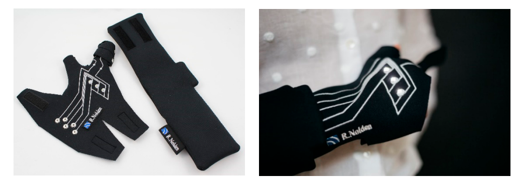
Figure 3. Smart glove and cuff; when forming a wrist, the LEDs light up giving feedback on the intensity of the bending of single fingers.

The smart glove (Figure 3) categorized as smart textile with a textile sensor system in combination with electronic components is a promising technology in the field of medical technology. It enables the mobile sensory detection of motion mobility of the fingers and can be used as a therapeutic measure and rehabilitation for the treatment of osteoarthritis, finger fractures, capsule and tendon injuries and finger stiffness. In addition to finger training, the smart glove also provides feedback by visualizing the motion signals using the LED-Functional Sequin Devices<sup>™</sup>. The feedback signalizes the success of the therapy to the operator, acts as a self-control over the motion training process and increases the motivation and the learning process. Due to the wireless conception and implementation, finger training can be carried out anytime and anywhere.