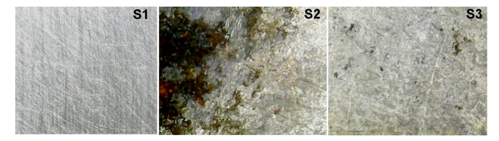
Figure 2. Surface morphology images of the carbon steel: blank (S1); immersed in seawater without natural seaweeds (S2); immersed in seawater with natural seaweeds (S3).

The surface morphology of carbon steel samples was examined in the absence and the presence of natural seaweeds in seawater (Figure 2).