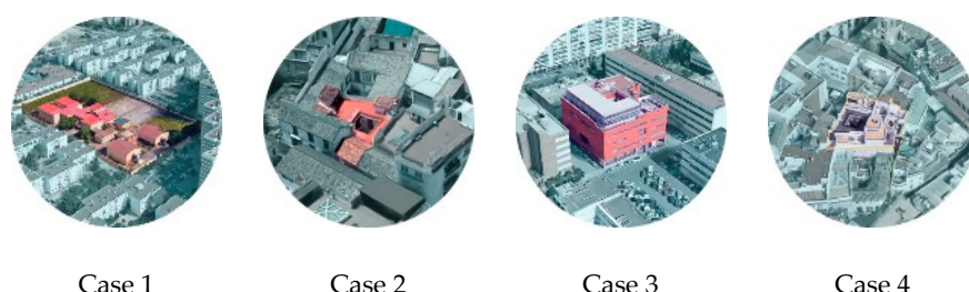
Figure 2. Cases study selected monitored for two-week in the cities of Seville and Cordoba (Spain).

In this work, we selected a range of case studies with a different AR interval. The 4 courtyards that constitute this set of case studies were each monitored for a two-week period in the cities of Seville (Seville, Spain, 37°22'58" N 5°58'23" W, elevation 16 m. asl.) and Cordoba (Cordoba, Spain, 37°53'30" N 4°46'22" W, elevation 106 m. asl.); all the courtyards were located inside buildings, which were either residential and public (Figure 2). With the aim of reducing the number of variables, courtyards with the same characteristics in terms of albedo and orientation have been selected.