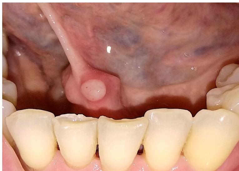
Figure 1. Patient before using the laser.