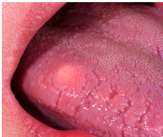
Figure 1. Clinical aspect of the lesion. A pink-yellowish submucosal nodule was detected on the posterior lateral aspect of the tongue.

A 16-year-old girl presented at our attention with an asymptomatic nodular lesion on the tongue. Clinically, the lesion appeared as a submucosal smooth nodule, 5 mm in diameter, covered by a pink-yellowish looking mucosa (Figure 1). On palpation, it was well defined, but not encapsulated. The lesion was located on the right posterior dorsum of the tongue, it had been slowly growing for a few months, and it was completely asymptomatic. The patient’s anamnesis revealed atopic dermatitis and pityriasis rosea.