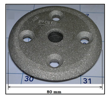
Figure 3. Both small and large components are produced using PIM. The marine hold-down produced from titanium for Earthrace Conservation for the Earthrace 2 vessel, is >300 g.

The global PIM market indicates the process is most viable for small components (1 to 20 g steel). The leading components are through mass production of electronic devices, such as smart phones, manufacturing with 100,000 units per day not uncommon. However, it is also shown to be a viable process for volumes of 5000 per annum [7] and even lower volumes can be seen to be profitable where the component size is large, material value is high, conventional processing is not possible and the complexity is high. Consider a very simple production tool has a useful life of 100,000 components at a cost of NZ$10,000–20,000 and this is a barrier to low product volumes or product development where the outcome is uncertain. The use of rapid tooling and mould inserts enable cost effective tooling to produce 10 s or 100 s of units and therefore enable the lower volumes and investigation with reduced risk. Current developments also enable profitable production of large (300 g titanium) components such as the marine hold-down shown in Figure 3. This component is produced in batches as small as twenty and less than 1000 annually.