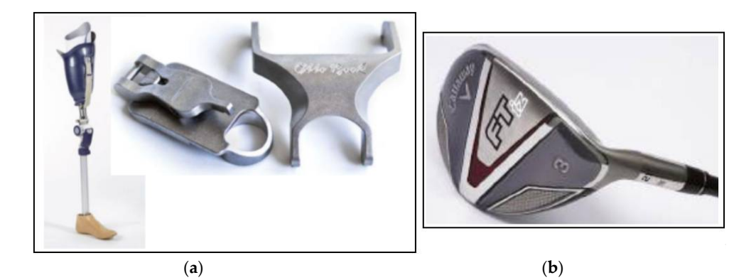
Figure 1. Sports application of the PIM process, ( a ) GKN Sinter Metals Germany produced MIM parts for the Otto Bocks prosthetic knee joint. ( b ) Callaway's FT-iZ Hybrid golf club uses adjustable weights produced by MIM (Images PIM International Vol. 4 No. 3, 2010).

Despite the cost the sport and leisure sector has been using titanium for many years [2]. Titanium is providing benefits for Paralympic athletes, wheel chair [18] and disabled sports [19]. It is showing strongly for amputees limb replacement (Figure 1a) as well as orthopedic inserts [20] where is considered to improve osseointegration and reduction/elimination of micro-motion causing damage [21]. Most prevalent is use in golfing (Figure 1b) as evidenced in the uptake for golf clubs [22], shafts [23] and balls. It is used in for sports shoes such as track sprinting and climbing spikes [24], motor sports for brackets and drive chains [25] and, skiing in both skis and bindings [26]. Titanium is also indirectly in demand for use in instrumentation and sensor devices cases [27] as well as new smart watches used for sport and leisure monitoring.