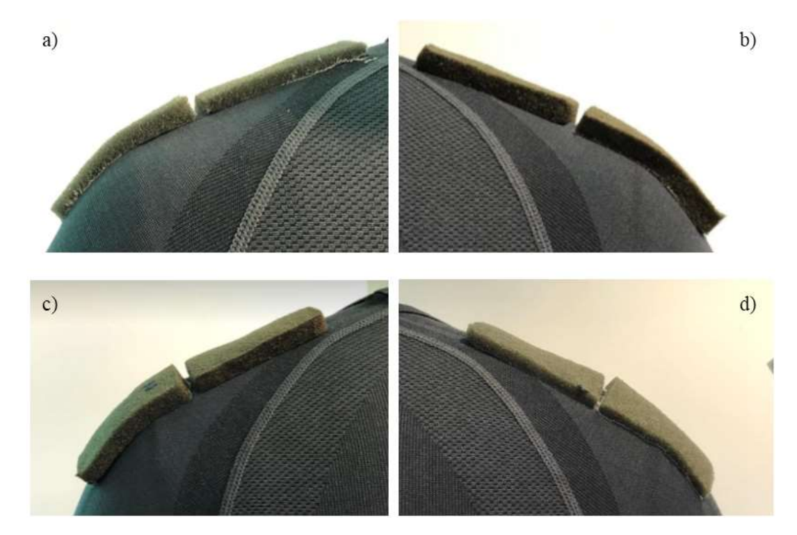
Figure 2. Images of the prototype garment, ( a ) front view conventional foam; ( b ) front view auxetic foam; ( c ) back view auxetic foam; ( d ) back view conventional foam.

The quantified results from the three tests, presented in Table 2, indicate that the auxetic foam sample was able to retain its depth whilst subject to tension when fitted to a mannequin. In contrast the data shows that conventional foam was found to decrease in depth under tension and failed to recover its original depth from one test to the next. The results are also recorded as images in Figure 2 which offer a visual contrast between the conformability of the auxetic samples (images B and C) and the thinning conventional samples (images A and D). This conformability is highlighted through the front depth and back depth of the samples. The results confirm that the auxetic samples are able to offer enhanced conformability in combination with a stretch sports top than the conventional counterpart.