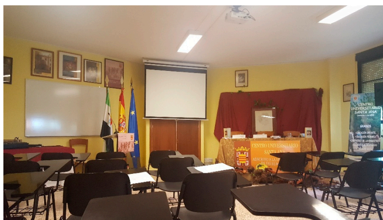
Figure 1. Room where the Conference of Viticulture and Oenology takes place.

As can be seen in Figure 1, the room where the Conference takes place is quite small with space for about 30–40 people, which makes the students feel comfortable when making the oral presentation. The Conference requires an oral presentation of the work as an indispensable condition for published it afterwards in a book. In Figure 2 the posters of the last four years of the Conference of Viticulture and Oenology celebrated in Almendralejo (Badajoz, Spain) are shown.