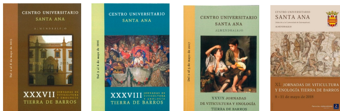
Figure 2. Posters of the last four years of the Conference of Viticulture and Oenology celebrated in Almendralejo (Badajoz, Spain).