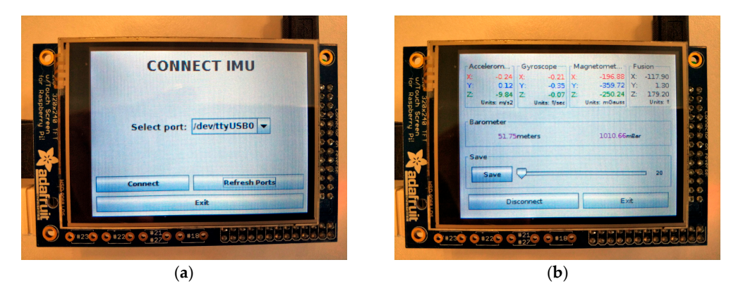
Figure 1. Main screens of the application: ( a ) IMU selection and connection; ( b ) Inertial sensor data visualization and data storage parameters.

The system has been designed to be able to receive data in a precise manner, i.e., the sampling frequency of the IMU needs to be accurate and configurable. This precision is required because the system will be used not only to measure object movements, but also to calibrate and correct computer vision techniques (that allow measuring the movement of objects in a non invasive manner). In Figure 2 we can see an example where the IMU is used to test a Computer Vision based tracking system used to measure the movement of a pendulum.